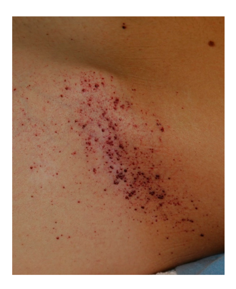
Figure 1. Multiple angiokeratomas on the right hip of a 33-year-old man.

A 33-year-old man presenting with multiple red-blue to black papules on his right hip and penis was referred to our clinic. Physical examination revealed multiple warty, keratotic, red-blue to black papules with a diameter of 2–5 mm on the areas mentioned above (Figure 1).