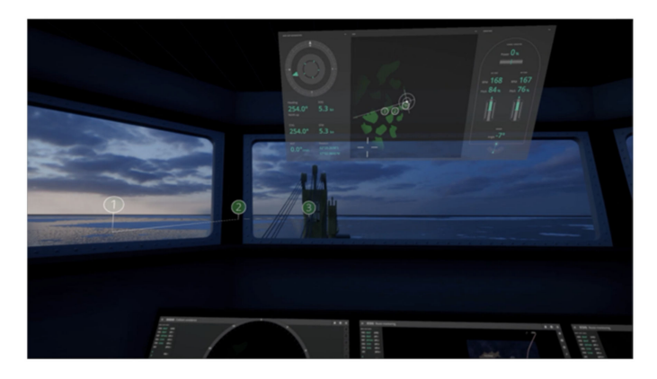
Figure 4. MV Explorer VR scenario.

The MV Explorer scenario lasted for 44 min and focused primarily on having access to information about ice conditions (Figure 4). This scenario also included a radar overlay on the ocean surface, the ability to plot a path through the ice, a night-vision zoom camera, and a searchlight.