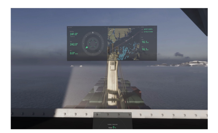
Figure 3. Vega Sagittarius VR scenario.

The MV Explorer scenario lasted for 44 min and focused primarily on having access to information about ice conditions (Figure 4). This scenario also included a radar overlay on the ocean surface, the ability to plot a path through the ice, a night-vision zoom camera, and a searchlight.