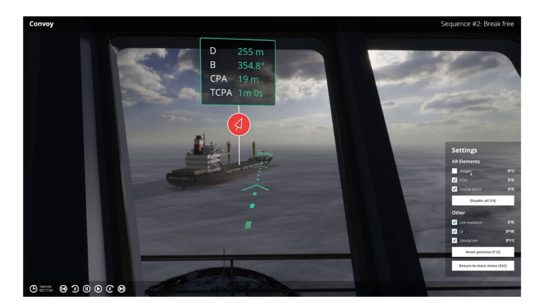
Figure 5. Icebreaking and convoy VR scenario.