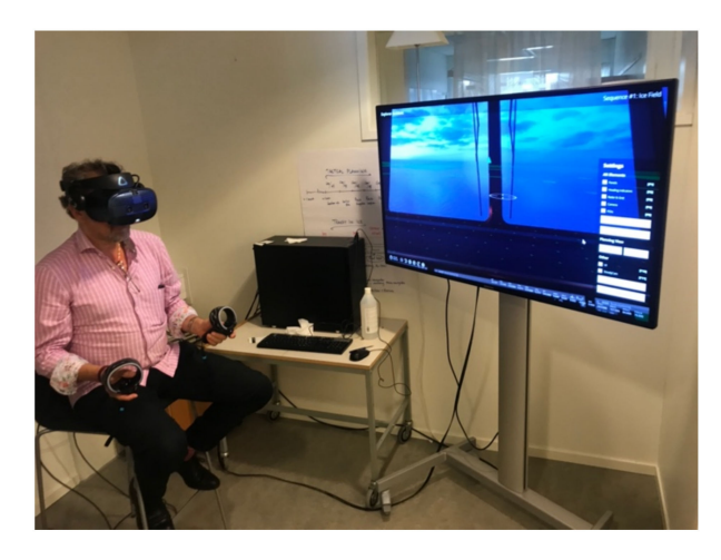
Figure 2. Virtual reality (VR) user testing the setup.

Only one scenario was tested at a time (per participant). The scenario began when the participant was seated and relaxed (Figure 2). The researchers had the same visual field as the participants had in VR through the large TV screen, which allowed for seamless communication when referring to specific objects. The researchers allowed the participants to get comfortable on the virtual bridge and encouraged them to explore at their own pace. Qualitative data were obtained through a think-aloud protocol. Each scenario tested different bridge designs and the overall VR experience.