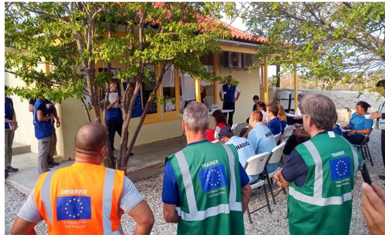
Figure 3. Debriefing session of the Caribbean exercise.

Regardless of if the simulation exercise takes place on-site or virtually, both the participants and facilitators the authors interviewed agreed that a clear briefing and introduction is crucial for a successful exercise. The main aspects which must be included in a briefing session are the presentation of a clear aim and objectives of the exercise, the day plan and schedule for the exercise, the areas and spaces which will be used during the exercise (if on-site), the ground rules to be followed by all participants, and an introductory round of the people in the room (either on-site or digitally) and their roles. The aim of this briefing is to effectively manage participant expectations, set clear boundaries, and ensure everyone knows how to engage with the exercise environment.