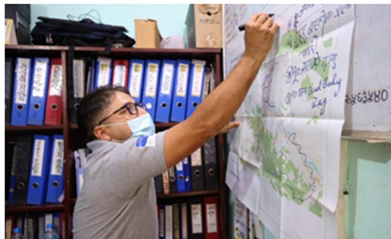
Figure 4. Nepali exercise participant providing input during the evaluation phase.

The evaluation phase (Figure 4) informs the successful achievement of the exercise purpose and objectives, often leading to an action plan or to the development of future exercises or next steps in the exercise program. It is also the part of the SimEx where it can be decided whether the exercise could engage the participants in an appropriately challenging exercise environment, built upon real life situations, scenarios, and existent and desired capabilities.