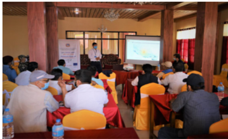
Figure 2. Nepali government officials during the briefing (including COVID safety instructions).

In order to ensure that the capacity-building process and the information shared and/or accumulated is emerging from a common ground of the participants, two essential elements of a simulation exercise come into play—briefing (Figure 2) and debriefing (Figure 3).