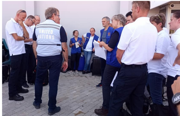
Figure 1. Facilitation team’s discussion on ground rules and aspects to be considered during the Caribbean exercise.

social contract, building social cohesion and providing physiological safety, thus enhancing coordination, communication, and collaboration during the exercise.