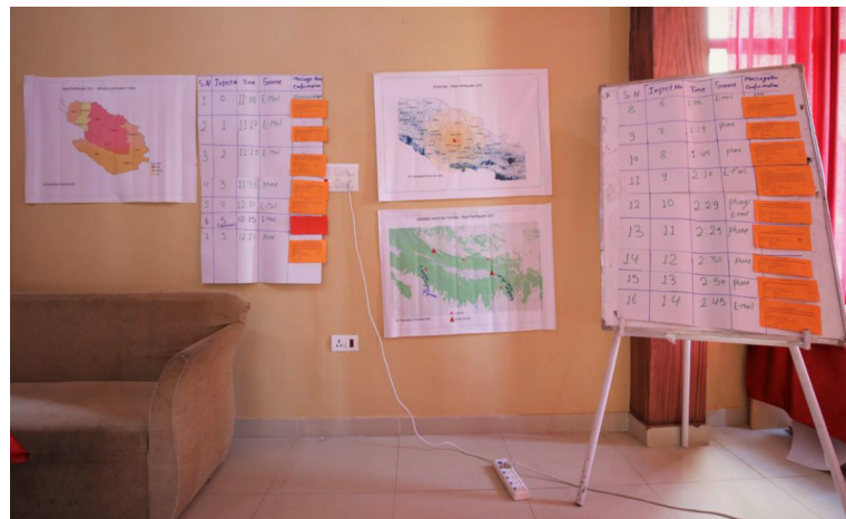
Figure 5. Monitoring simulation flow from the ExCon during the Nepal exercise.

The design elements are extremely important in preparing a SimEx, but they could not be identified without a clear exercise purpose and specific objectives, since the two are the elements guiding the planning of the exercise. Thus, a comprehensive scoping process must be conducted, aimed at identifying and agreeing on the purpose, objectives, outcomes, audience, and exercise context. When this process is finished, some of the physical functions can be derived from its results. They are extremely diverse and can range from establishing clear communication lines within the facilitation team, but also among the facilitation team and the participants, the story-telling process, including role-players, etc. When it comes to the communication lines, they are controlled by the Exercise Control (ExCon) cell (Figure 5), which can be smaller or larger depending on the size of the exercise. This cell includes individuals who are assigned administrative and logistical support tasks during the exercise and are overseeing the implementation of the exercise, and in practitioners' exercises, dealing with media and media requests, supporting the handling of VIP visits, and are responsible for the safety and security of all participants and staff.