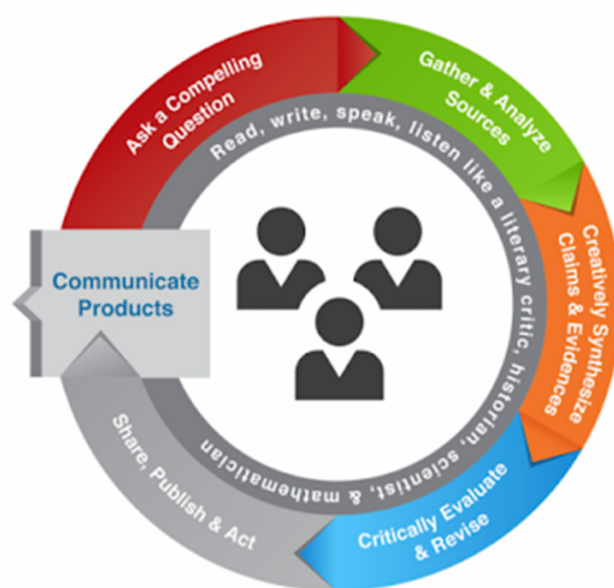
Figure 1. Project-based inquiry (PBI) global [5].

PBI Global has five phases (see Figure 1) in which learners work together in small groups to investigate and develop solutions toward meeting the 2030 SDG targets. As teachers and students prepare for inquiry, attention must be given to activating and building students' background knowledge on PBI Global content (i.e., the SDGs) and the inquiry process itself [20]. Students then apply this knowledge as they ask a compelling question aligned with their specific SDG interests. These questions can be comparative, solution-oriented, and/or action-oriented and propel students to dig deeper into their SDG-aligned topic of interest [19]. Once student groups have a fairly well-defined question directing their inquiry, they gather and analyze digital and print sources, and sometimes engage in original data collection, related to their question. The information that students gather and analyze is then creatively synthesized into claims and evidence in written and visual forms [5,21]. Throughout the inquiry process, students engage in multiple feedback loops to critically evaluate and revise their research question, sources, findings, and learning products. Students then have the opportunity to communicate their products to a larger audience and take social action (i.e., share, publish, and act). For more detail regarding PBI Global design and implementation, see Spires [5] and Himes [21].