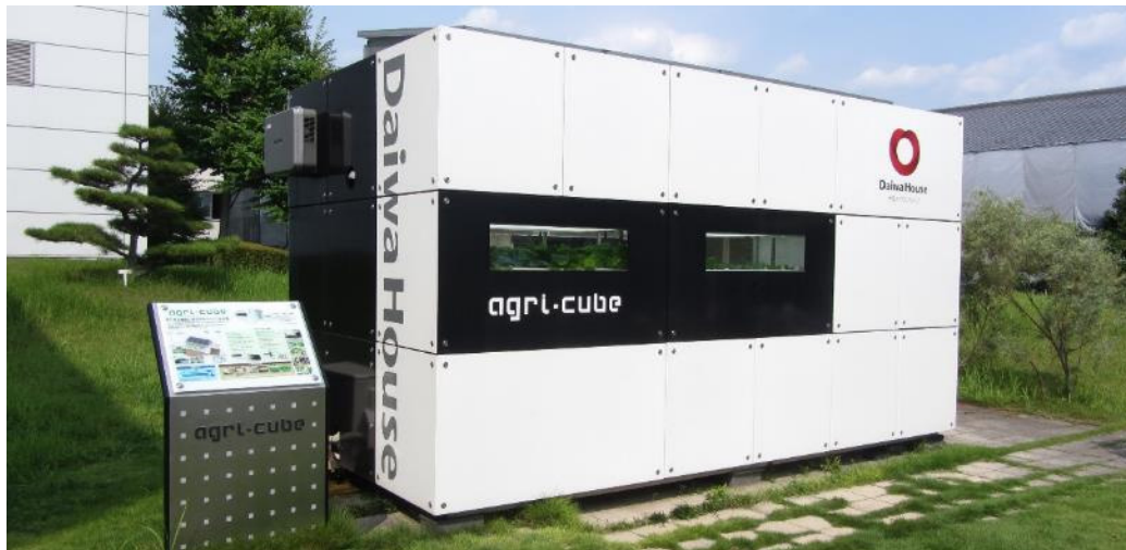
Figure 2. Daiwa House's research of agri-cubes for hydroponic planting.

provisional housing complex [37]. Facing the Kumamoto Earthquake in 2016, the planning time for preparing a site layout and overall plan for emergency housing was reduced to one hour by Daiwa House in collaboration with Kumamoto University [38]; this has greatly shortened the timeframe required and enables prompt response to cope with natural disasters. Daiwa House has also developed agri-cubes for hydroponic planting (Figure 2).