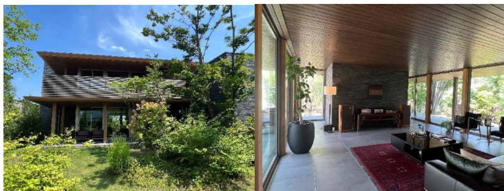
Figure 3. Exterior and interior of a display home of Sekisui House.