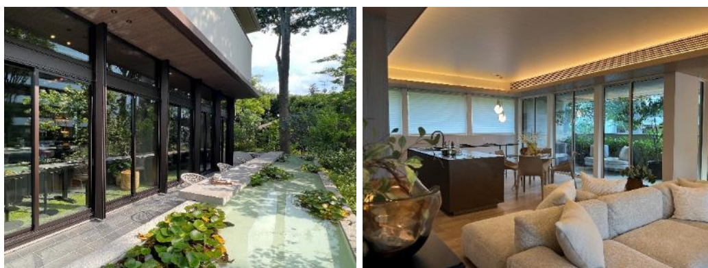
Figure 6. Exterior and interior of a display home of Misawa Homes.

During the design process, customers are encouraged to visit display homes and choose from basic available house floor plans first before selecting numerous options to personalise their homes (Figure 6). This reduces the time and effort to design the house from scratch and to have better control of the budget [66]. Although Misawa Homes only offers prefabricated timber houses, various house designs are available for customers to select, ranging from affordable MJ Wood series with post-and-beam construction [62,67] to prefabricated timber panel constructions of the Genius house series with 2.6m high ceilings [68] and the Century house series [69], in which the recent model of Century with Storage ZEH Advance House has up to a 3.3m high ceiling [70]. Prefabricated single-family houses are offered in single-storey, double-storey, and three-storey versions depending on the customers' budget and requirements.