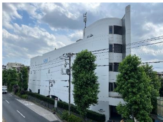
Figure 7. Misawa Homes Institute of Research and Development in Tokyo.

Misawa Homes® expertise is the proprietary timber panel adhesion system for prefabricated construction. The Misawa Governance System for Earthquake Oscillation Control (MGEO) vibration damping device was released in 2004 to reduce the earthquake damage to houses [73]. The earthquake damage evaluation system Gainet was launched in 2015 for measuring the degree of earthquake damage to a house in real time, uploading the data to a cloud server instantaneously for analysis, and informing the homeowners of the status of the damage via smartphones or other digital devices [63]. The ECO Micro Climate Design was firstly introduced in the Century VikiCourt House in 2006 to maximise the comfort of the house during hot summers and cold winters [73]. The M-Wood2 product was developed by Misawa Homes in 1998 as a 100% recycled material by reusing waste timber and plastic. Having similar colour and texture to timber itself, M-Wood2 has better weather resistance performance and can be repeatedly recycled and reprocessed [64]. In 2017, the Century Monocoque prefabricated timber construction technique was developed using 120mm thick timber panels to achieve higher thermal insulation performance [74]. The LinkGates system using Internet of Things (IoT) was released in 2018 to keep household energy use at optimum levels and provide crime prevention and security monitoring services [75].