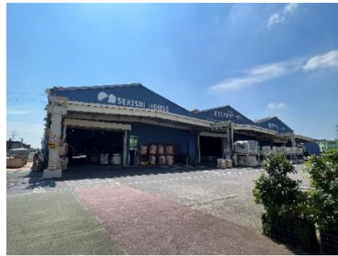
Figure 5. Eco First Park of Sekisui House with recycling facilities.