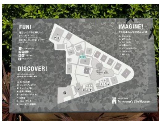
Figure 4. Tomorrow's Life Museum of Sekisui House.