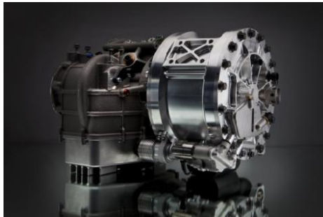
Figure 4. Jaguar hybrid car flywheel. Reprinted with permission from the copyright holder.

Jaguar used a mechanical flywheel system from Flybrid Automotive in their hybrid car Jaguar XF from 2011. The flywheel is made of composite, and the transmission to the driving wheels is made by a Torotrak/Xtrac CVT gearbox. The system weighs 65 kg and stores 120 Wh at 60,000 rpm. The maximum power to be delivered is 60 kW. The fuel savings is around 20% [50]; see Figure 4.