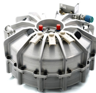
Figure 5. GKN Hybrid Power Flywheel.

The Williams Formula 1 team developed a system similar to Flybrid Systems', but it was never used during an Formula 1 race. Nevertheless, their technology has been used in other races, such as the Le Mans 24 h race in 2012, where an Audi R18 e-tron quattro became the first hybrid car to win the race. The magnetic part of their flywheel rotor consists of magnetically-loaded composite material instead of solid magnets. The rotor is also rotated in a partly depressurized environment to decrease the peripheral drag losses at the same time as allowing the bearings to operate in atmospheric pressure. The storage capacity is 140 Wh, and the rated power is 150 kW [52–54]. A photo of a GKN Hybrid Power flywheel can be seen in Figure 5.