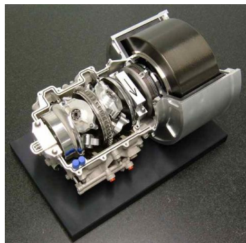
Figure 3. Flybrid Systems Formula 1 flywheel for the 2009 season. Note that the power requirements are quite high, and the mechanical power transfer system (a continuously-variable transmission) is a large part of the machine.

In Formula 1, the flywheel has been used as a temporary energy storage since the rules were changed in 2009, allowing such equipment. The supplier of this KERS (Kinetic Energy Recovery System) was the company Flybrid Systems [5]; see Figure 3 and Table 6.