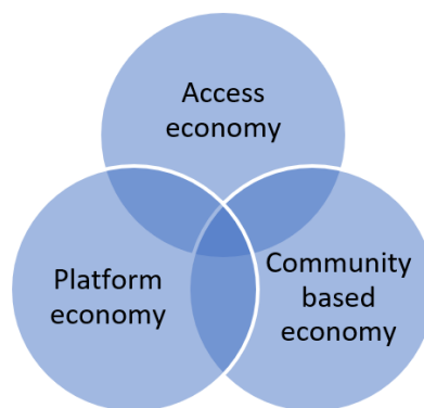
Figure 1. Conceptual underpinnings of the sharing economy. Borrowed from Acquier et al. [24].

Taking the above into account and contrasting the sharing economy with terms like collaborative consumption, the gig economy, peer-to-peer economy, circular economy, and consumer-to-consumer economy, Acquier et al. [24] proposed an organising framework for the sharing economy that rests upon “three foundational cores”. Visible in Figure 1 below, these are: (1) access economy (e.g., the sharing of underutilised assets for optimising resource use), (2) platform economy (e.g., digital platforms mediating decentralised exchanges among peers), and (3) community-based economy (e.g., coordination through “non-contractual, non-hierarchical or non-monetized forms of interaction”) [24].