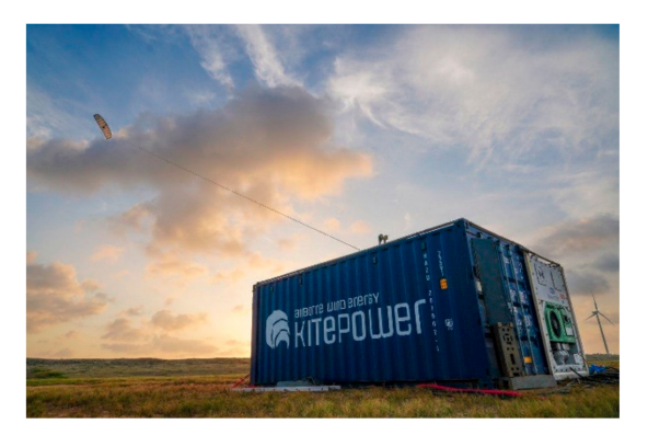
Figure 2. Pilot operation of the 100 kW AWE system of Kitepower on the Caribbean island Aruba in October 2021.