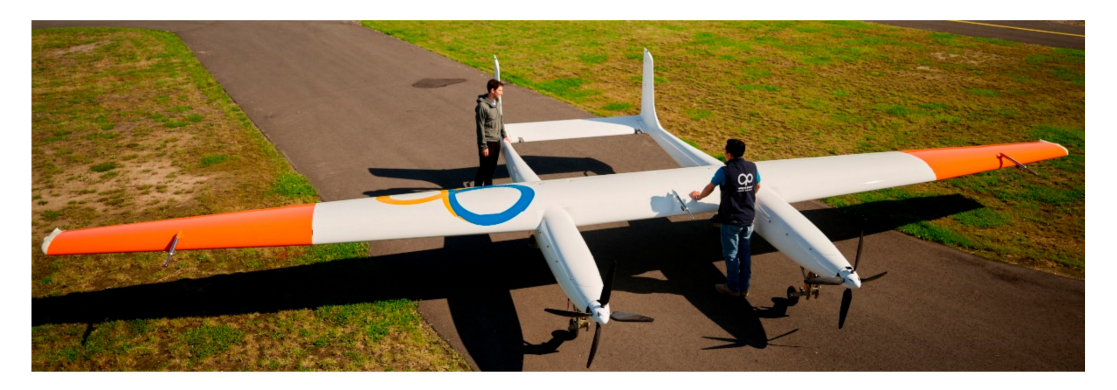
Figure 3. Ampyx Power's AP3 during flight testing on Breda International Airport in May 2021 (photo courtesy of Ampyx Power B.V.).

Concerning flight operation, only the lift forces of the kite are transferred to the ground and converted into electricity there during crosswind and tether-aligned operation. For the rotational operation of the entire kite, on the other hand, the torque of the kite is transferred and converted at the ground [20]. During crosswind operation, the kite flies figures of eight or circles during the reel-out phase, increasing the amount of energy harvested [21]. The combination of a fixed ground station with crosswind operation is most common [21]. Table 1 presents an overview of the technical specifications of the different prototypes currently being tested by AWE developers.