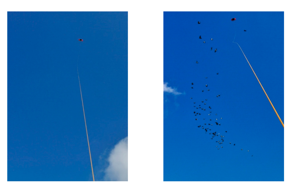
Figure 5. Pilot operation of the 20 kW kite power system of TU Delft [88] before ( left ) and after a bird collided with the tether ( right ). The bird continued the flight seemingly unaffected, which suggests that bird collisions with a tether are possible but do not necessarily have to be fatal.

The only peer-reviewed study on the ecological impact of AWE estimated that between 2 and 13 birds would collide with the kite, and around 11 would come into contact with the tether per year, resulting in an annual total of 13 to 24 bird fatalities [10]. The estimates were based on predictions for year-round 24/7-operation of Ampyx Power's planned 2 MW fixed-wing kite, with a tether length of 1 km and an operating altitude of 200–450 m. The bird activity level at the site was assumed to be "moderate". The authors reported that the estimated bird fatalities for AWE fall within the range of bird fatalities that have been recorded for wind turbines (0.6 to 63 fatalities per year, with a median of 7). They considered the number of bat strikes for AWE to be negligible [10]. The results were not based on field data of AWE but rather on comparisons with bird mortality statistics for glider aircraft and power lines and should therefore be interpreted with caution.