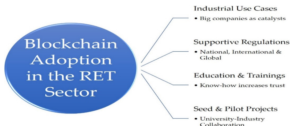
Figure 3. Roadmap for Blockchain Adoption.

Such insights from the RET industry experts as well as a theoretical foundation based on literature review have served to develop a “Roadmap for Blockchain Adoption”, which is presented in Figure 3. It proposes measures that could significantly boost the DLT adoption perhaps not only in the renewable energy sector but in other fields as well. We suggest that multi-sector involvement is needed to implement this disruptive technology. We believe that the university-industry collaboration could lead to introducing several pilot projects aiming to show the practical applications of blockchain and to reveal the most burdensome challenges during its performance. Such actions could raise the interest of the R&D or digitalization departments of the leading energy companies, including the ones focused chiefly on renewables. In fact, the so-called ‘big players’, which are often partly country-owned or strongly supported by the government, have a reasonably higher possible influence on the policy makers, which could result in the introduction of supporting regulations, that are inevitably a sine qua non for the functioning of blockchain in a given country or region. This would result in growing numbers of new use cases, to which—with the help of training and information activities—the society could swiftly adapt.