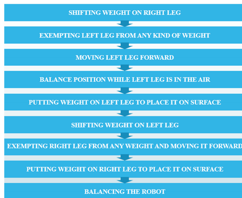
Figure 1. Flow chart explaining implementation of walking algorithm for 17-DoF humanoid robot.