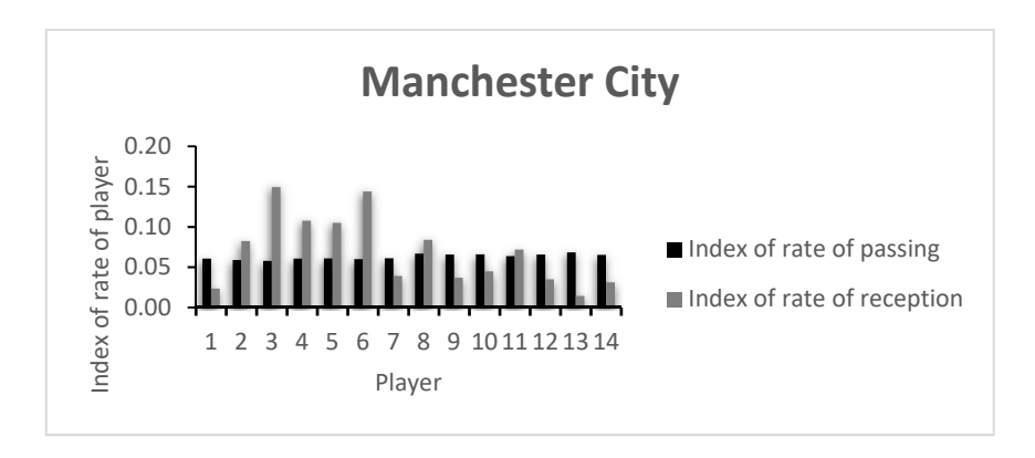
Figure 4. Mancester City's index of rate of passing and reception.

The low index values presented by the players are in accordance with the rate of variability presented in Figures 1 and 2, as well as in Table A1. Here, a comparative analysis may be made between players, taking into consideration that the values shown are always between 0 and 1, the least and most variability possible, respectively. In this example, both teams keep relatively similar values for the index of passing variability. However, the index of receiving variability shows more dissimilar values, with CH's Player 3 presenting the highest team value. CH's Player 4 was substituted early in the game, showing a low index value. An analysis of the opposing team shows that apart from MC's goalkeeper (Player 1), Players 7 and 9, both on the starting 11 and both substituted around minute 60, showed low indexes of reception variability. This may have happened due to the effective defensive strategy of the opposing team, lowering the possibilities of ways of getting the ball to them, or due to an ineffective capacity to create receiving opportunities in that game.