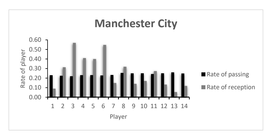
Figure 2. Mancester City's Rate of passing and reception.

When looking at the capacity of receiving variability, Player 1 is among the teams' least variable. These are both goalkeepers, and the obtained values are in accordance with what is expected in a football game: passing to the goalkeeper is not common and very often regarded as an extraordinary occasion. Alternatively, and if this player takes part in the organization of the attack, they receive the ball from a very limited number of players—usually the center backs. In fact, this kind of option is taken in MC's strategy when the team incorporates the goalkeeper in the passing sequences. Naturally, variability here is minimal. It is also worth noting that field players with little capacity of receiving variability such as CH's Player 4 (Thiago Silva) or the substitute Players 13 and 14 (Kovacic and Pulisic) may show this characteristic due to the time each player played. Thiago Silva played only 39 min due to a sudden injury, and Kovacic and Pulisic entered late in the game. As for Player 9 (Timo Werner), the fact that this is a forward/striker, the early lead by CH in the game, or the team's tactical setup may explain the low value.