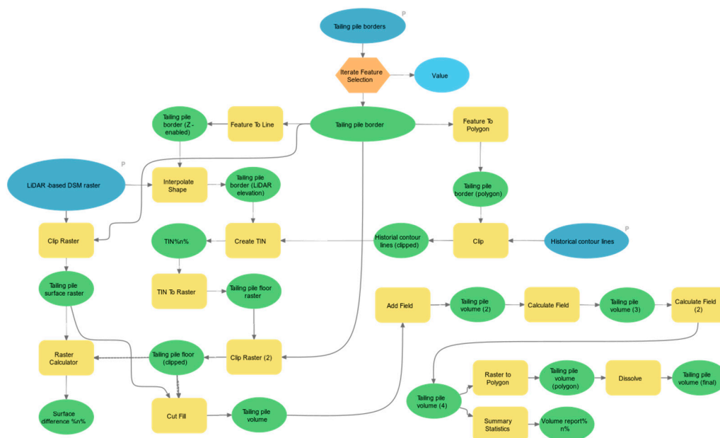
Figure A1. Workflow of tailing pile volume estimation developed in ArcGIS Pro Model Builder.