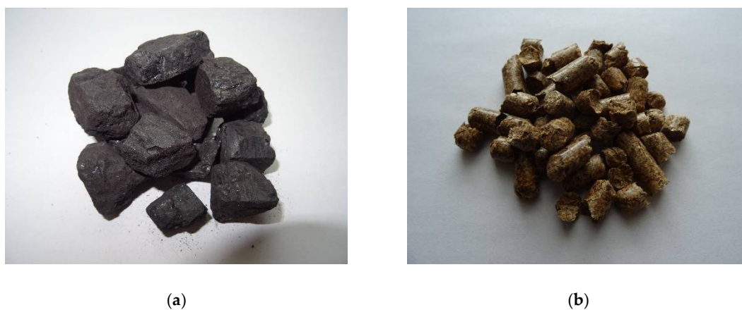
Figure 1. View of the fuel used in automatic boilers with a retort burner: (a) eco-pea coal, (b) pellets.

due to gravity, from the feeder placed above the furnace and to gradually move towards the furnace.