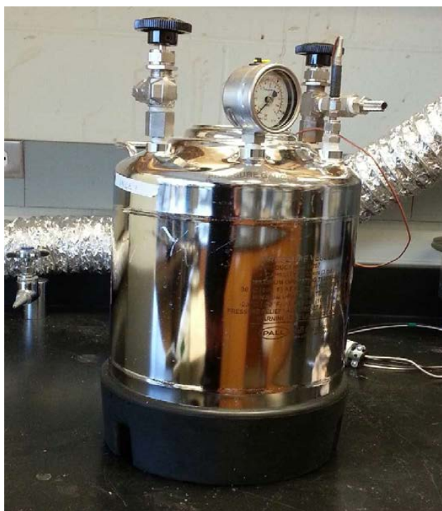
Figure 1. Ammoniation reactor with internal volume of 3 L.

High Performance Liquid Chromatography (HPLC) with a Bio-Rad Aminex HPX-87P column (Aminex HPX-87P, Bio-Rad Laboratories, Hercules, CA, USA) and a refractive index detector (Varian 356-LC, Varian, Inc., Palo Alto, CA, USA) were used to measure sugar contents. Acid soluble lignin (ASL) content was determined by UV-Visible spectrophotometer (UV-2100 Spectrophotometer, Unico, United Products & Instruments, Inc., Dayton, NY, USA).