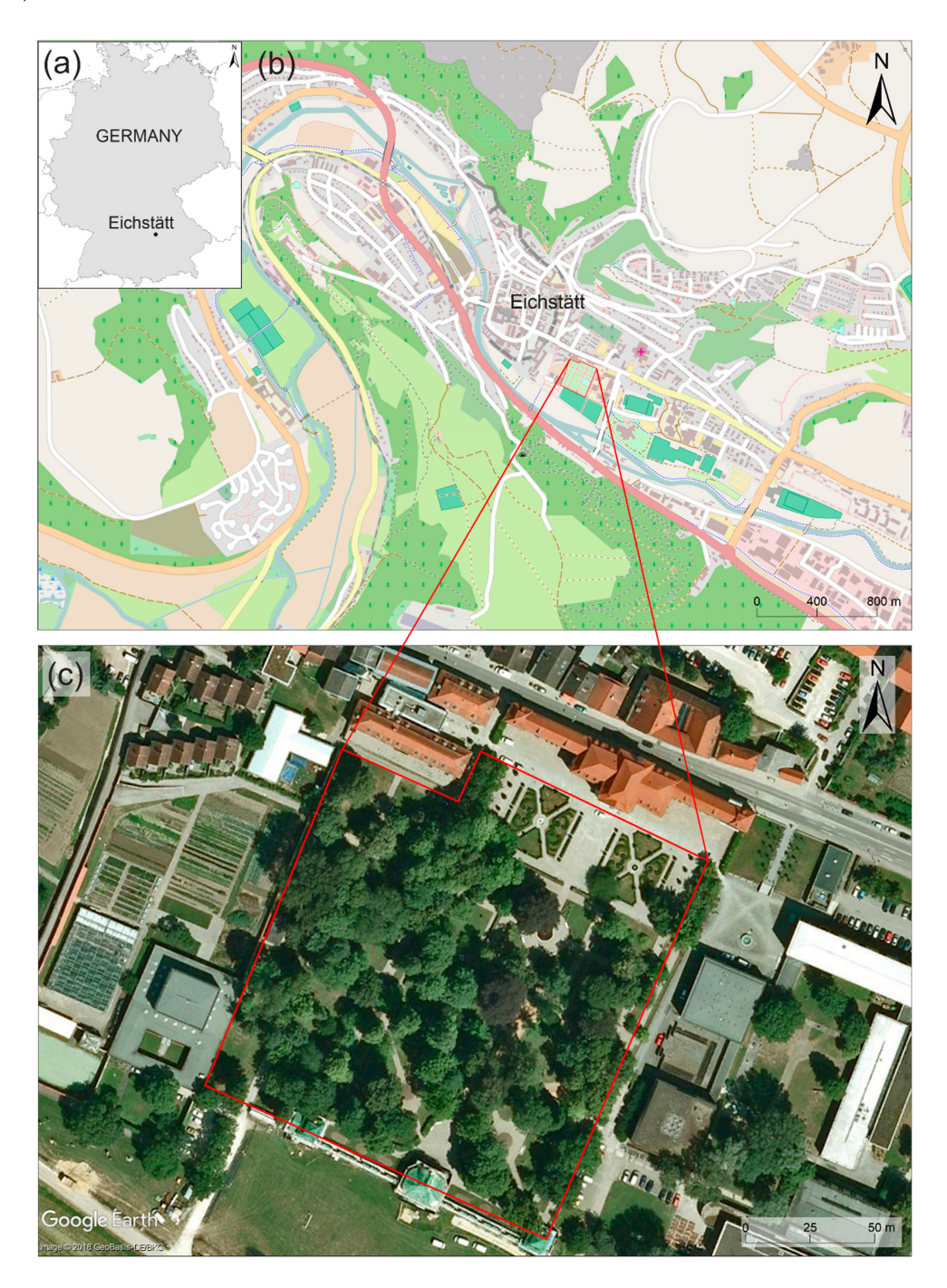
Figure 1. Location of the study site in Germany (Eurostat, NUTS 2013/EU-28) ( a ) and in the city of Eichstätt, red border; ( b ) OpenStreetMap; ( c ) GoogleEarth.

areas. The rectangular-shaped urban park lies south-east of the city center, next to the main campus of the Catholic University of Eichstätt-Ingolstadt (Figure 1c). Hofgarten has an area of 22,480 m<sup>2</sup> (~2.2 ha). In 1735, the park was designed as a baroque garden and partially transformed to an English garden after 1817. In recent times, these concepts were combined leading to a composition of geometrically designed and accurately pruned baroque elements with long and structured avenues and a variety of some very old trees originating from Europe, North America and Asia [20]. Recently, the park counts 231 trees and shrubs of 69 different species (excluding hedges, flowerbeds and grass and herb species) (Table 1).