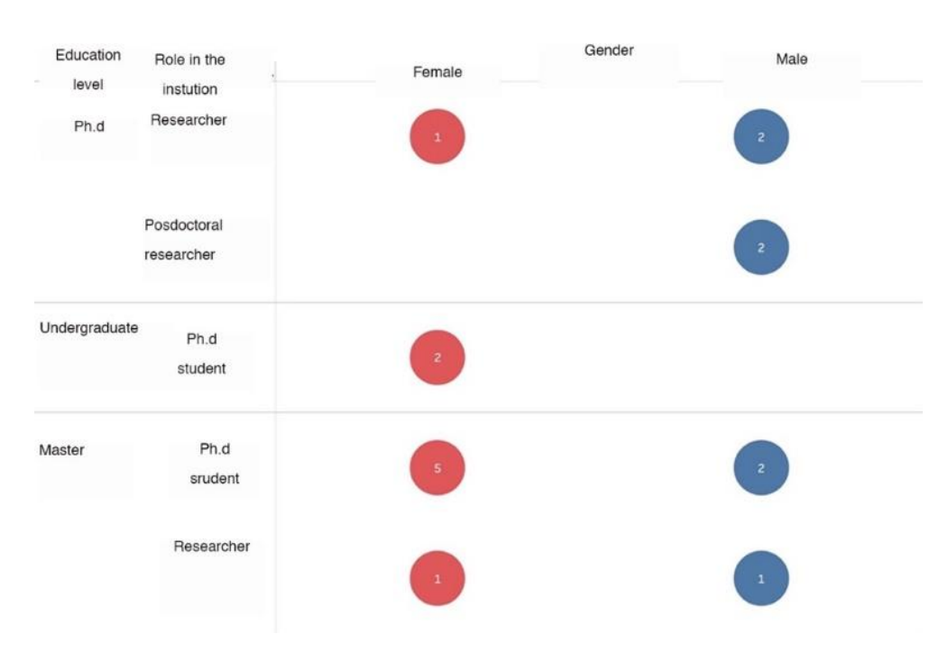
Figure 1. Demographic information of the focus group participants, gender, and education level. (own elaboration).

To identify the level of repository use, the survey asked, "Have you used the repository?" 50% of the participants chose the answer, "I do not know of the existence of an institutional repository and its purpose." 25% chose, "I have uploaded papers at the request of my academic program director," 12% chose the answer, "I have uploaded OER by request of my department head," and 13% chose, "I have uploaded my thesis by institutional request" (see Figure 2).