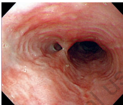
Figure 1. Esophagoscopy revealed a mucosal bridge in the middle part of the esophagus.

mucosal bridge has been a subject of speculation. It was reported that mucosal bridge formation may be related to undermining of the mucosa by ulceration, followed by healing with re-epithelialization of the mucosal undersurface and formation of a mucosal tube attached at each end to the non-ulcerated wall. 8 Alternatively, it may simply represent the attachment of the free ends of pseudopolyps to the adjacent mucosa. 3 We presume that chronic, repetitive, esophageal ulceration and healing led to the formation of the mucosal bridge through these mechanisms.