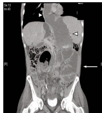
Figure 2. Coronal view of the computed tomography scan of patient #2. Cluster of intestinal loops was seen in the left lower mid-abdomen (white arrow). In addition, the esophagus and stomach were extremely dilated (white arrow heads).