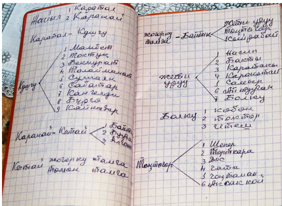
Figure 5. A notebook kept by a veterinarian from a former collective farm, consisting of 25 pages of genealogical charts. The first page above shows the descent of Kushchu and Kitai from Jayil, and the division of Kitai into upper and lower tamga (property marks). Jeti Uruu ('seven lineages') is given as if the name of one son at the top of the second page, but then jetu uruu without capital letters below seems to clarify that this is collective name for the seven lineages listed: this list includes the same seven uruu as in Figure 4, although in a different order.