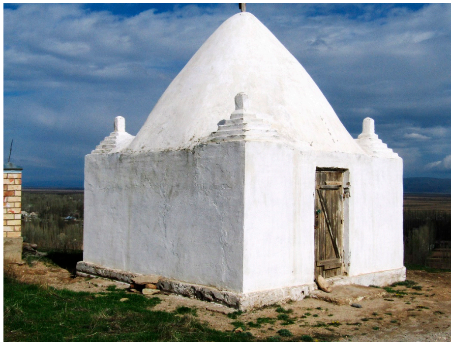
Figure 6. Ak Uy.