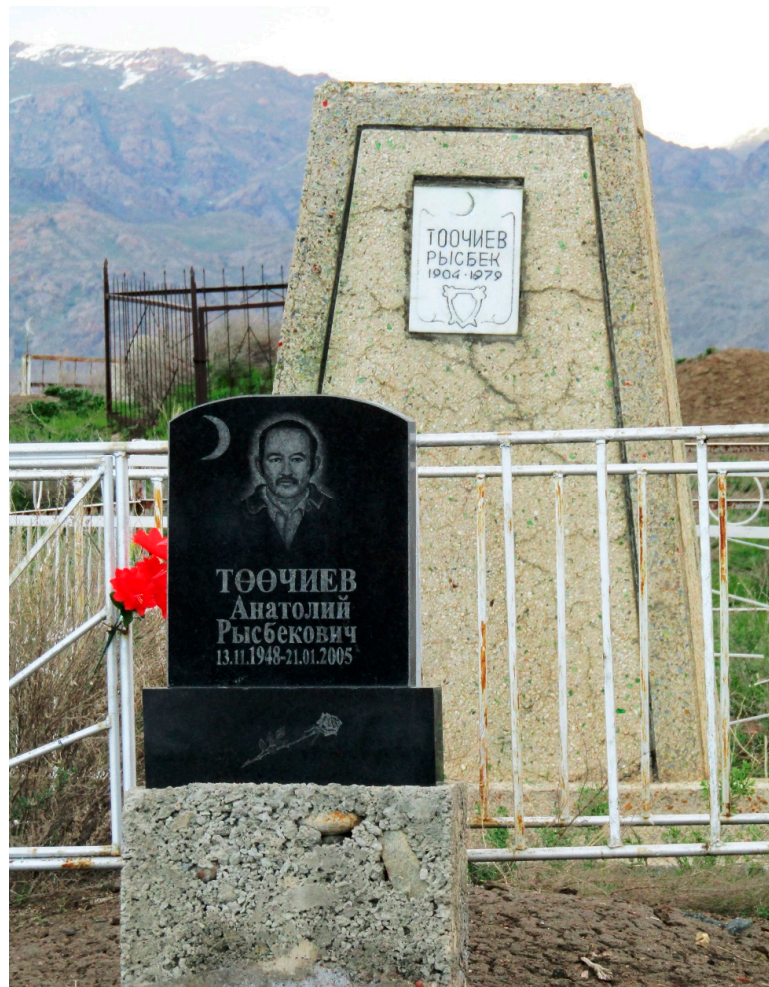
Figure 2. Two generations of graves showing naming after the Soviet-imposed adoption of family names and patronymics. This cemetery is at Ak Döbö (the site of the ancient city Tekabket) across the river from Talas city. This man's given name Anatoliy is very uncommon among Kyrgyz, but reflects a limited Russianization of Kyrgyz personal names during the Soviet period.

had grown up together in Kara Buura, I found boys better informed about their classmates' lineage identities than were girls, suggesting that boys discuss this among themselves in ways that girls do not.