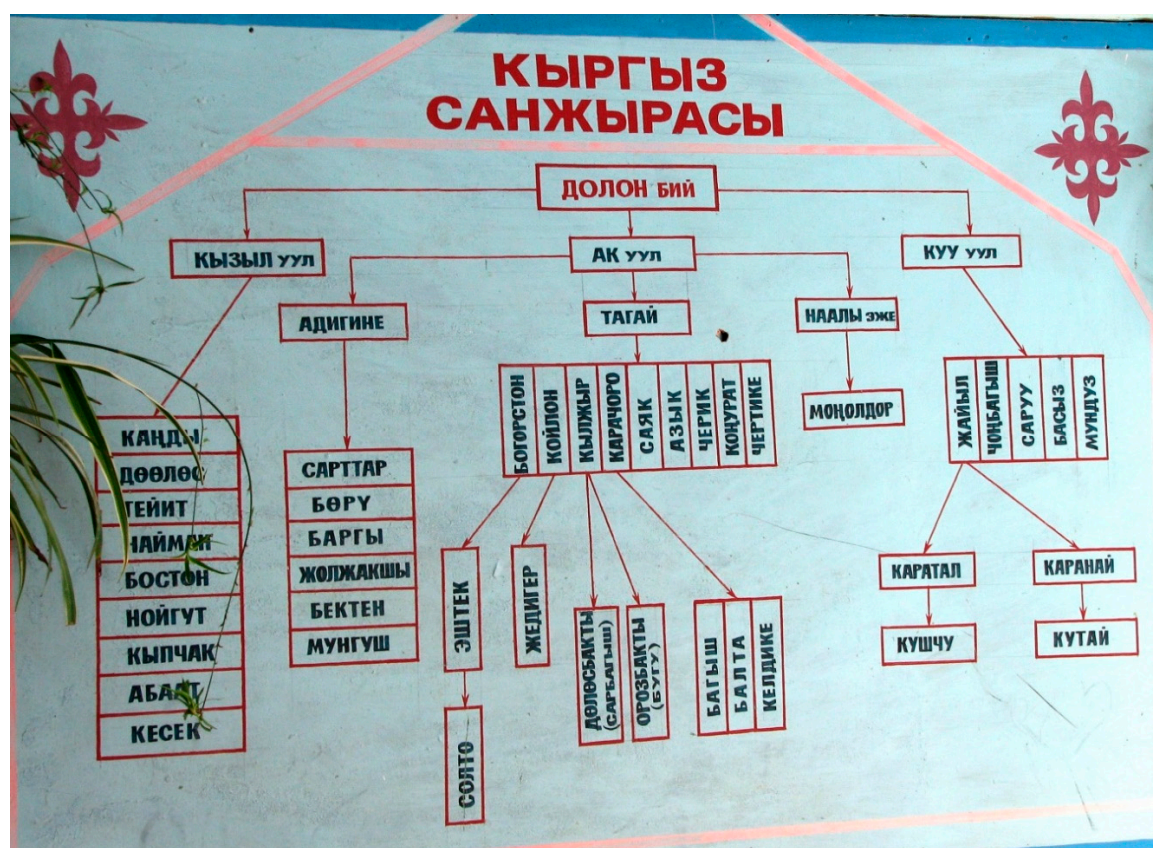
Figure 1. Chart in a Kara Buura middle-school history classroom showing the national Kyrgyz sanjirası (“sanjira of the Kyrgyz”) with the three branches at the top leading to 34 canonical top-level lineages. This common simplification in Kyrgyzstan creates a spectrum of categories rather than detailed chronologies, and implies that the apical ancestors were all within a few generations of one another and closely related. Important uruu in Kara Buura district are Kushchu and Kutay (Kıtay) at the bottom right, along with Saruu in the middle of the group of five above them. Jetigen does not appear in this version.

sons, broken up into paragraphs, with only occasional comments specifying profession, birth place, marriages, or deaths. Only the most significant figures receive more detailed narratives in these textual genealogies. This form is the most compact and tends to be used by those such as Jakipov who aim at maximal inclusiveness. The third important form is the more limited jeti ata (seven fathers) list of ancestors which may in fact list 10 or more, and is often said to be the basic personal genealogy that a man should know. These lists specify only the direct line of forefathers of the individual, and ignore other agnatic ties.