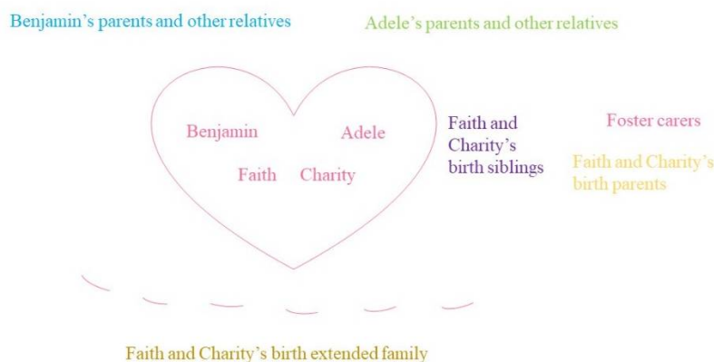
Figure 1. FAMH4 (different-gender couple) family map depicting the “core family unit”, including both parents and their two adopted daughters, and intentional kin.

proceeded to represent other kinship connections (usually where kinship was established through biological relatedness or partnership connection) and thus included their own extended family and their adopted child's birth family on their family map representations. In the present study, we focus on examining the intentional kinship connections that adoptive parents also included on their family maps.