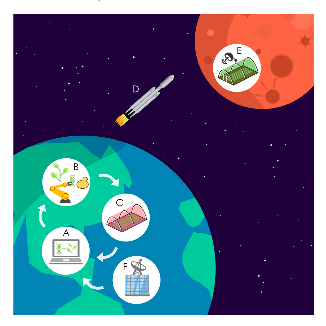
Figure 3. Schematic roadmap for research on adapting life to Mars. The Mars Biofoundry integrates the design of synthetic biology approaches ( A ) with an automated platform for implementing bioengineering designs in plants and microbes ( B ) and a facility for high-throughput phenotyping under simulated Martian conditions ( C ). The process iterates as a design-build-test cycle. Eventually, engineered organisms could be periodically transported to Mars ( D ) to perform experiments within miniature growth facilities ( E ). Remote monitoring of performance on Mars ( F ) would provide critical knowledge to adjust the work carried out at the biofoundry on Earth.

Achieving the proposed goals of adapting plant and microbial life to thrive on a Martian environment in a timeframe compatible with the forthcoming human expeditions to the red planet will require novel approaches. We propose that this formidable challenge can be tackled by establishing a 'Mars Biofoundry', that is, an automated and versatile platform capable of expediting the engineering and high throughput phenotyping of biological systems adapted to the environmental conditions that will be encountered on Mars (Figure 3).