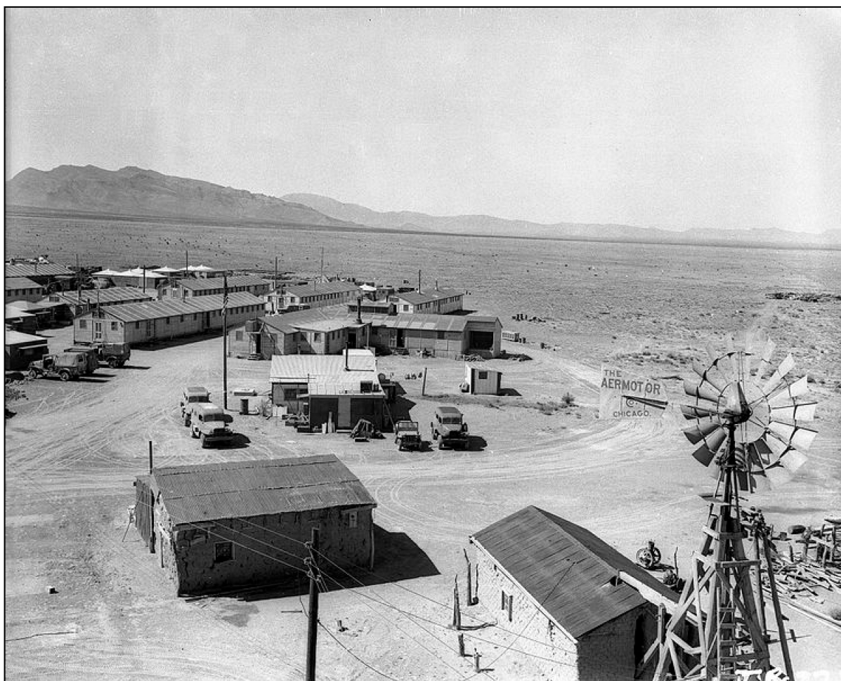
Figure 2. Trinity Test Base Camp, edge of Jornada del Muerto desert, New Mexico, May 1945.