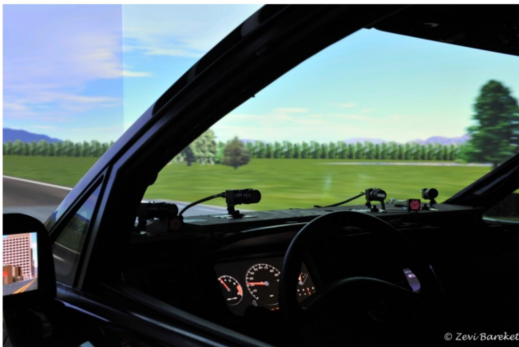
Figure 2. A SmartEye four-camera eye-tracking system in a virtual driving simulator environment ( http://www.umtri.umich.edu/what-we-offer/driving-simulator , accessed on 18 March 2020, with permission given from University of Michigan Transportation Institute (UMTRI) [56].

Eye tracking methods have been used to study driving using simulators in older adults (Figure 2).