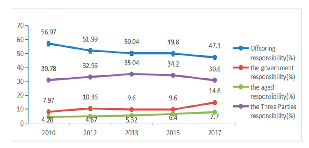
Figure 2. Changes in COACR in China during 2010–2017.

Based on the existing literature [37] and the sample description of COACR in 2017 in Section 3.3, the frequency change of COACR in China during 2010–2017 can be obtained (Figure 2). The statistical result shows that residents have significant differences in COACR. The majority of people in the sample believe that offspring should be responsible for old-age care, indicating that Chinese residents have a unique preference for offspring to be responsible for old-age care. Second, the Three Parties are responsible. The aged account for the smallest proportion, which is probably related to China's long-standing concept of "raising offspring for old age". However, the authors also find that with the passage of time, the improvement of social and economic conditions and the gradual improvement of the social security system, people's idea of old-age care are changing. Although most people still believe that offspring should be responsible for providing for the aged, this trend is decreasing year by year. The concept of "The Three Parties share equally" rises up first and then falls down. Meanwhile, the believe that the government and the aged should be responsible is increasing year by year. In particular, the rise of the "government responsibility" is most obvious. This trend indicates that people have begun to gradually recognize other ways of old-age care modes besides offspring responsibility.