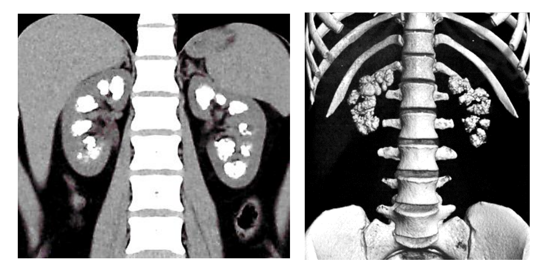
Figure A1. Coronal reformation of unenhanced CT-scan shows bilateral numerous pre-calyceal lithiasis and severe medullary nephrocalcinosis but without uretero-hydronephrosis.