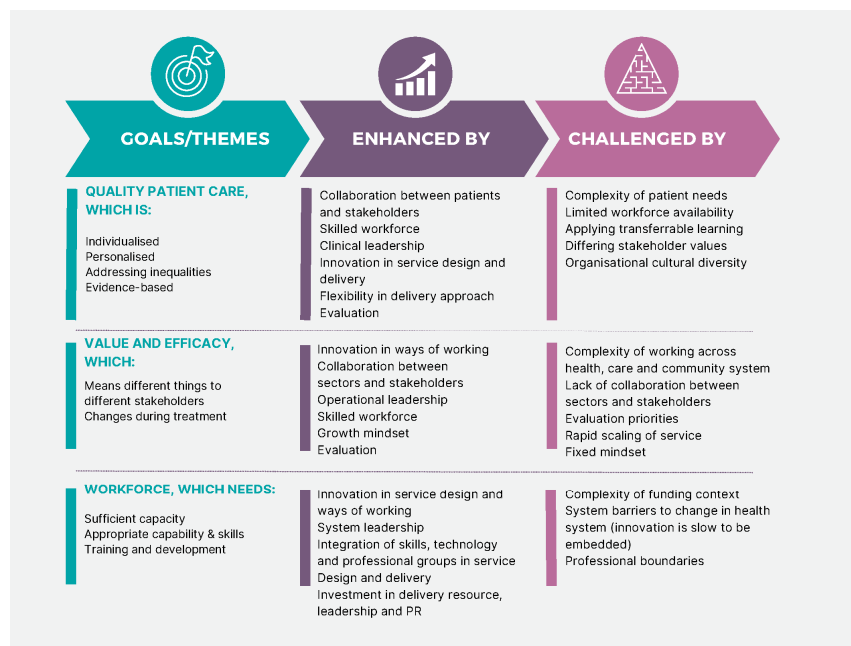
Figure 2. Summary of learning.

Throughout setup and first year of service delivery, several challenges and learning opportunities presented themselves to the Active Together team. These are discussed here and summarised in Figure 2.