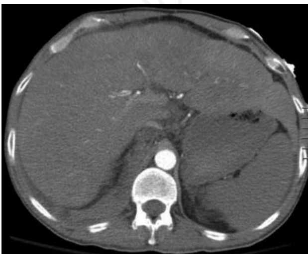
Figure 2. Massive hepatomegaly measuring 27.2 cm in cranio-caudal dimension.