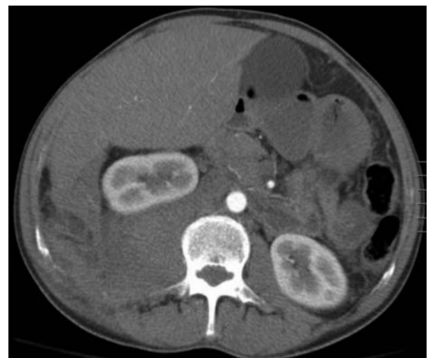
Figure 3. Large right retroperitoneal hematoma displacing right kidney superiorly.