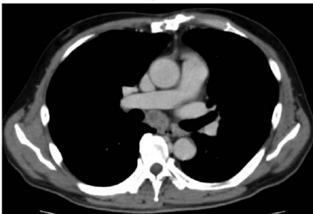
Figure 1. Enhanced computed tomography revealed mediastinal lymphadenopathy.

MDS is a group of clonal myeloid disorders that often progress to acute leukemia. Pancytopenia is a common finding. Cell-mediated immunity is seriously impaired and patients are predisposed to infections, which account for