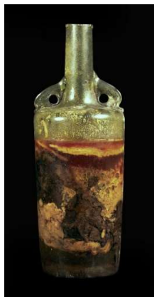
Figure 1. Speyer wine.

Barbaricum in the first centuries of the current era. It was found in Speyer, a town located on the Rhine in the state Rhineland-Palatinate in Germany. This wine, dating back to 325 AD, is preserved in a greenish-yellow, cylindrically shaped glass bottle with two dolphin-shaped handles and was retrieved from a tomb of a man and a woman of Roman origin [7].