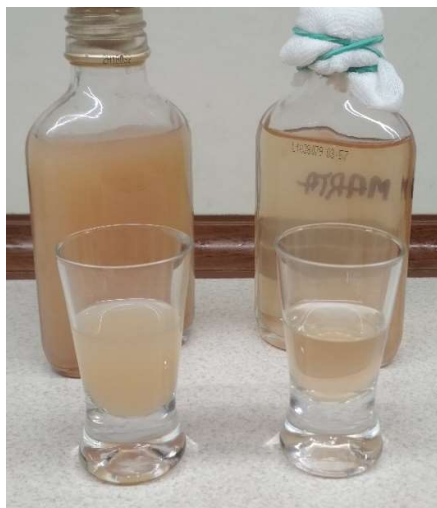
Figure 3. Wine samples before analysis. Left: Sample 2 (stored at 6 °C); right: Sample 1 (stored at room temperature).

After tasting, the wine was divided into two parts and poured into glass bottles. Both bottles were then left for one month in order to observe any changes in preservation at different storing conditions. Sample 1 was stored at room temperature (20 to 22 °C) whereas Sample 2 was stored in a refrigerator at a constant temperature of 6 °C (Figure 3).