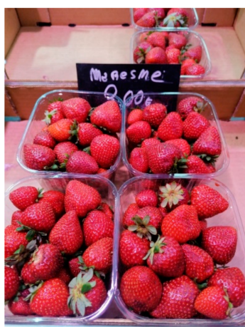
Figure 3. An example of a regional product: strawberries from Maresme, Catalonia.