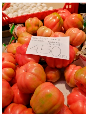
Figure 2. An example of a local product: tomatoes from Blanes, Girona.