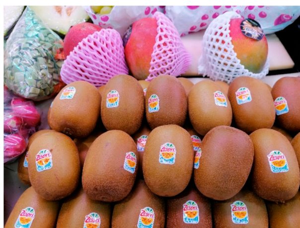
Figure 5. An example of an international product: kiwis from New Zealand.

Finally, Table 3 shows the aggregated data in relation to the origin of each of the fruits and vegetables. In particular, the proximity can be independently analyzed per product. It is observed that apples are mostly locally grown, which is explained by the fact that Girona apples have a quality label (Protected Geographical Indication). However, some food stores sell apples from international markets, as mentioned above, such as Chile, but also from famous apple countries such as Italy and New Zealand. Tomatoes, melons and onions either come from Catalan and Spanish territories, where Andalusia and Murcia are major agricultural regions. Finally, while peaches grow in regional fields, pears predominantly come from national and international markets, and the origin of potatoes is both local and global.