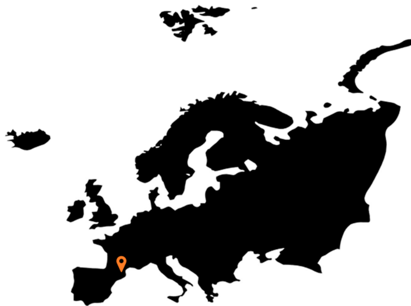
Figure 1. Location of Girona, Catalonia.

Following previous research [38], this paper investigates the origin of foods available at the municipal market of Girona. In particular, data collection is focused on fruits and vegetables because within the context of products being sold at municipal markets, “fruits and vegetables are the products that present a greater variety, and, therefore, a greater weight in the total” [38] (p. 221). Mercat del Lleó includes nine places that sell fruits and vegetables [78] and all of them are included in the sample. Fieldwork and data collection were carried out during the last week of June and the first week of July 2021. A total of three visits were made to the Mercat del Lleó, where nine interviews were conducted with