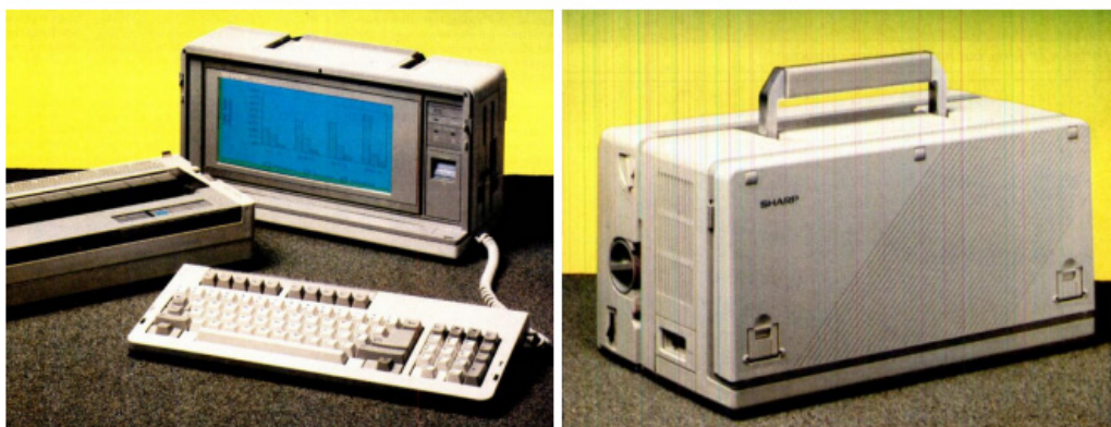
Figure 8. The Sharp PC-7000.

The Sharp PC-7000 (1984) consisted of three main components: a system unit with a display, keyboard, and printer. All of them had cream, light grey plastic housings. The keyboard and the printer could be clipped to the main unit to form a suitcase (Figure 8). Its handle made the system easy to carry, particularly without the printer (weight without the printer was 18 pounds or about 8 kg). With the printer clipped, the case grew significantly heavier by 11.5 pounds or over 5 kg. The complete set weighed about 13 kg.