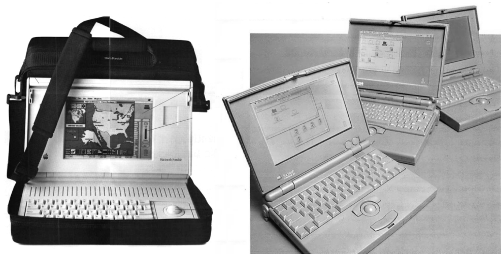
Figure 10. Left to right: The Macintosh Portable; Apple's PowerBook 170, 140, and 100 set the standards for portability and ease of use.