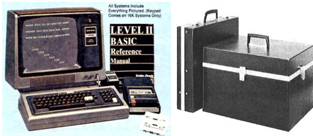
Figure 2. Carrying cases from Radio Shack. Microcomputer Newsletter–Edition No. 2 (1978–11).

Computers were not cheap in the 1980s. It was not a good idea to carry them far without a carrying case. It did not take long before manufacturers offered dedicated ‘briefcases’ and covers for transporting the computers. The carrying cases for the first portable computers looked nothing like today’s briefcases. They looked more like trunks for wheeling equipment because it would be hard to carry a dozen or several dozen kilograms of equipment in a large box through the city (Figure 2).