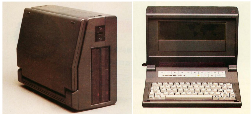
Figure 5. The Osborne 3 with an 80-character by 16-line liquid-crystal display (LCD) and two 5.25" floppy-disk drives.

Following a reorganisation, Osborne Computer Corporation (OCC) was ready to conquer the market with two new computers, the Osborne Vixen and the Osborne 3 in late 1984. Determined to regain his market position, the founder Adam Osborne abandoned the CP/M operating system and manufactured his first and last IBM-compatible machine, the Osborne 3 (Figure 5). The Osborne 3, advertised as midsize, no-frills, portable, was the last portable system by OCC.