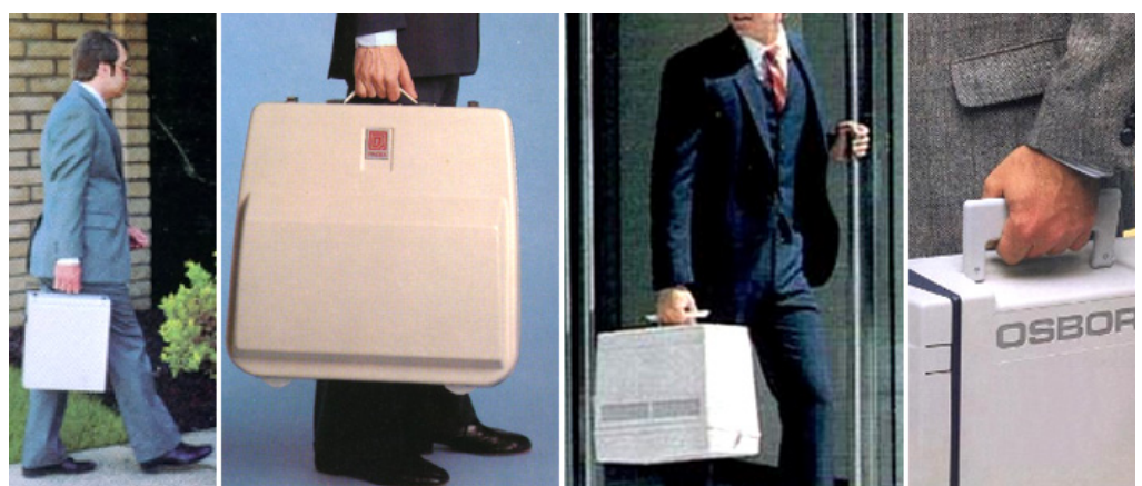
Figure 1. Briefcase-sized computers (the 1980s). In the figures, left to right: the Otrona Attache, Findex microcomputer, TRS-80 Model 4P, Osborne Vixen.

One of the distinguishing features of the businessman of the 1980s was slightly inconvenient briefcases. They contained no papers or writing implements but were cases of portable computers (Figure 1). It was the philosophy of computer manufacturers tens of years ago that a complete kit with a display in a case should be taken from the office to home and back, and also used for business travel.