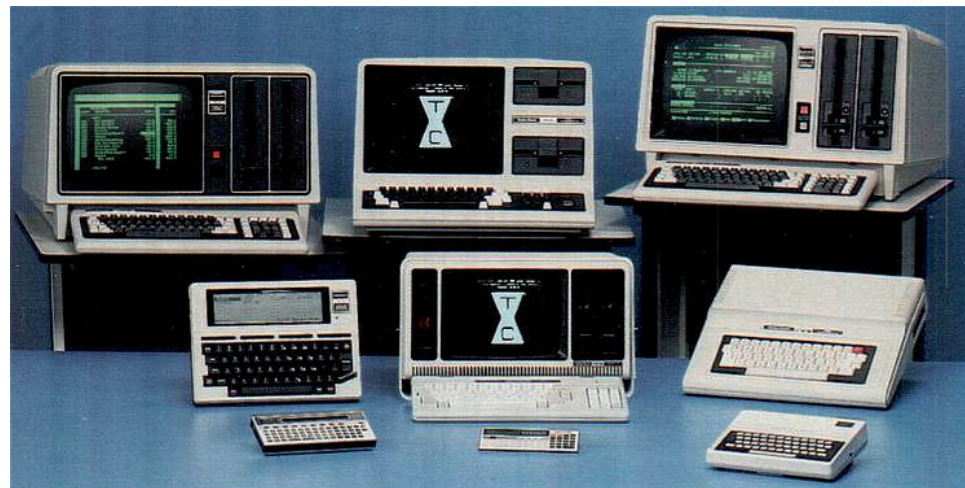
Figure 6. The Radio Shack TRS-80 line (the Model 4P in the centre of the bottom row, 1983).

The TRS-80 Model 4P portable system (1983) was advertised as 'the perfect computer for our mobile society' that can be taken along literally everywhere (Figure 6). The Model 4P was easy to carry and small enough to stow in luggage racks on a plane, train, or bus.