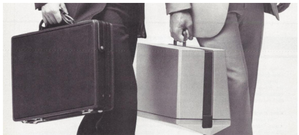
Figure 3. On the right-hand side is the Osborne 1 with its briefcase-sized body.

Not all portable computers came with a separate dedicated carrying case. Many systems had cases that doubled as carrying devices. A good example is the Osborne 1 with its small monitor in a plastic case (Figures 3 and 4). The user would open and close it just like luggage that it resembled thanks to a leather handle. It weighed 24.5 pounds or 11 kg. Consecutive Osborne machines, the Osborne Vixen, for example, were also ‘enclosed in carrying cases’.