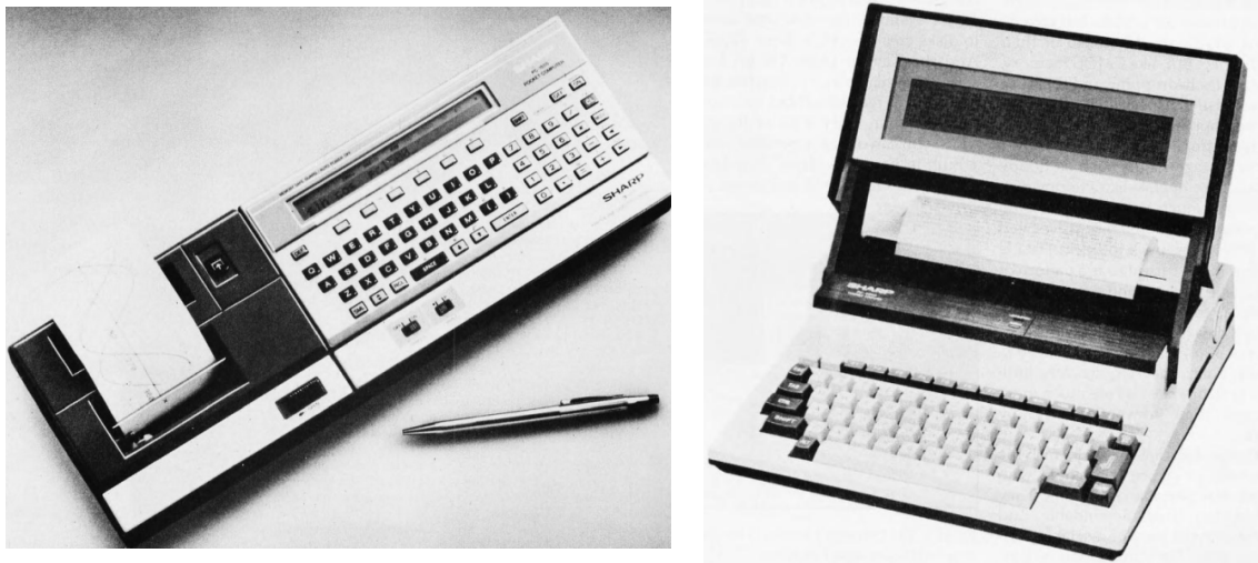
Figure 11. Left to right: The Sharp PC-1500 is a typical pocket computer. The flip-up 80-character by 8-line LCD screen on the Sharp PC-5000 is only one-third the size of a standard CRT screen.

The Commodore SX-64, also known as the Executive 64, or VIP-64 in Europe, was a portable, briefcase/suitcase-size ‘luggable’ version of the popular Commodore 64 home computer and held the distinction of being the first full-colour portable computer. The machine was carried by its sturdy handle, which doubled as an adjustable stand.