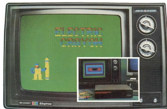
Figure 7. The Electric Crayon was $249.95 (April 1980). It was delivered complete with the EGOS system, 1 KB of video memory, and a thick user manual.

It was not easy to offer colour, 'advanced' graphics in the 1980s. In most cases, additional components, generators, or controllers were used. A good example is the TRS-80 with a peripheral colour graphics generator/controller the Percom Electric Crayon (Figure 7), which offered a semigraphics mode as well [33].