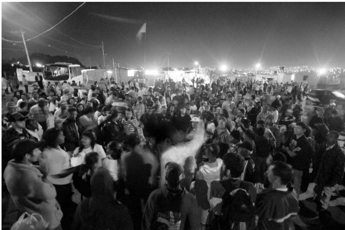
Photo description: Popular assembly in the early years of the occupation.

From the articulation of the CPT, a support network was born. At the beginning, this was composed of religious affiliates of the Catholic church, but later it expanded to public lawyers, social architects, and political scientists, along with other professionals. Important agents of these networks were groups from universities, including undergraduate and graduate students who also became involved in the daily challenges of the expanding occupation.