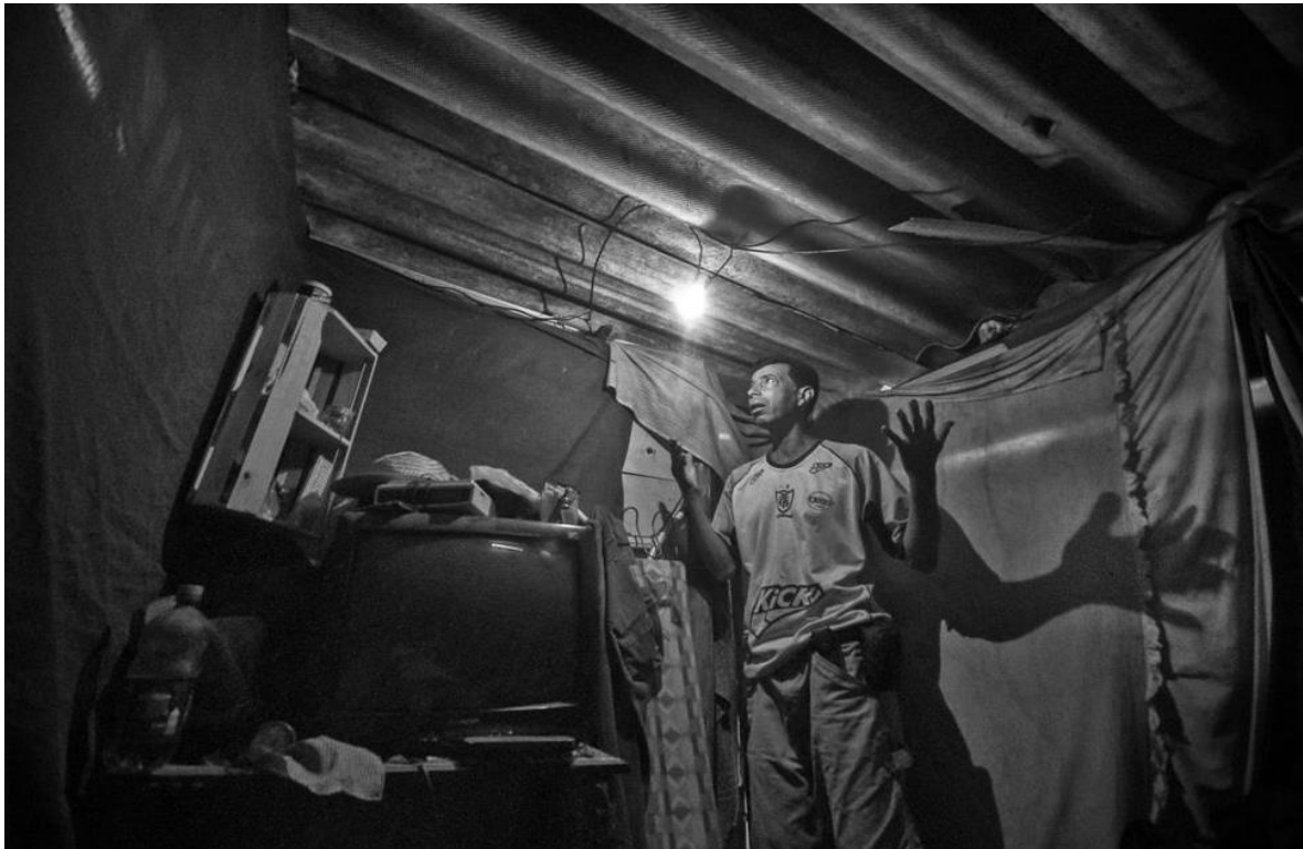
Photo description: Dweller of the community in a canvas tent at the beginning of the occupation.

Dandara, the name chosen to baptize the community, was that of a black woman and a warrior, the life-mate of the leader of the slave resistance in Brazil, Zumbi dos Palmares, and an important reference point in the fight against the slavery of the Portuguese American period. 2 Dandara was an important warrior and strategist. When her freedom was threatened she chose suicide rather than returning to a life of slavery.