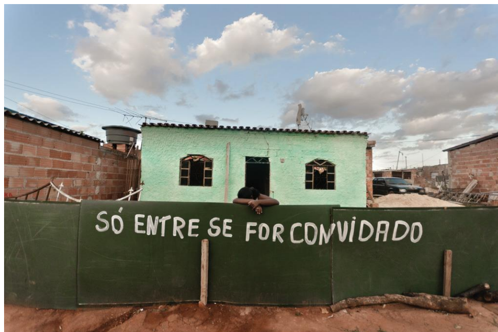
Photo description: Only enter if invited.

Once the territory was occupied, the Brigadas Populares (a political organization and social movement) took on the process of organization and resistance with the residents. It sought to promote the maintenance and self-construction of housing on the land. In the first few days news of the occupation gained national attention. The media coverage further increased the number of families that joined the occupation process. In three days the occupation increased from 150 to 1086 families. “It was nice because it happened like this, it was a surprise that we had to work so quickly! Within five days, it had already reached 1200 families.” This is how Frei Gilvander, an important figure in the history of the occupation, remembers the beginnings of Dandara.