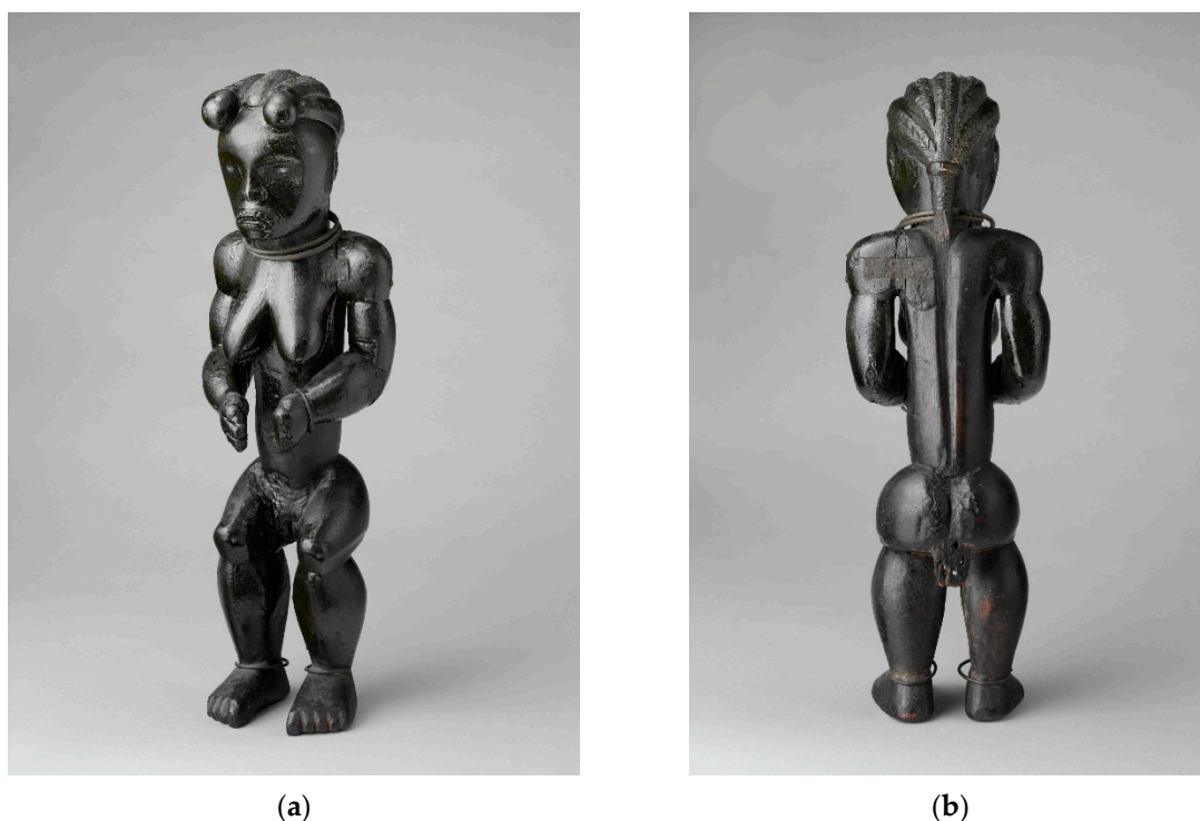
Figure 6. Anonymous. Side (a) and back view (b) of a female figure from a reliquary ensemble (19th–20th century). Wood and metal. The Metropolitan Museum of Art. Source: https://www.metmuseum.org/art/collection/search/310870 .

From the 19th century onward, the colonialist order and a rising interest in ethnography have justified the looting of African artifacts on a large scale while depriving the countries of origin of their cultural heritages. In the report Witness to History: A Compendium of Documents and Writings on the Return of Cultural Objects , Alain Godonou stresses that today “90 percent to 95 percent of African heritage is to be found outside the continent in the major world museums” (Godonou 2009, p. 61). By re-contextualizing, classifying, and cataloguing these objects with new official narratives and scenographies, Western museums have asserted their power to control their meanings in a hierarchical perception of the world. Artifacts lost their properties in the process of becoming objects of scientific inquiries. They were stripped of their affiliation to their communities and of the performative rituals that animate their abilities.