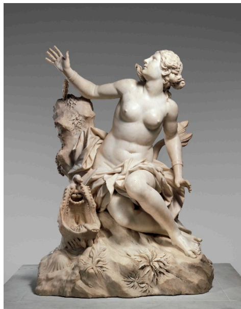
Figure 1. Domenico Guidi, Andromeda and the Sea Monster (1694). Marble. The Metropolitan Museum of Art.

An aspect that captures the attention is the centrality and sensuality of the black female body unveiled in Apeshit 's iconography. Shadows of semi-naked dancers eclipse the canonical body of Western masterpieces. Beyoncé's assertive display of black sexual desirability dialogues with European conventions of high art which have historically erased or dehumanized the black female forms. Examples of these discriminatory practices have ranged from the long-lasting depictions in European art history of the Ethiopian princess Andromeda—famous in Greek mythology for her distinctive beauty—as if she were a white woman (Figure 1) (McGrath 1992), to the Dutch painter Christiaan van Couwenbergh's confronting oil painting Rape of the Negro Girl (1632) (Figure 2). Today, the subject is up for debate with the exhibition Le Modèle Noir de Géricault à Matisse (The Black Model from Géricault to Matisse) on view at the French Musée d'Orsay (Paris) from the 26 March to the 21 July 2019. The display is based on Denise Murrell's Ph.D. Dissertation (Murrell 2018) at Columbia University (New York) that raises the question of the (sexual) agency of the black female muse in French modern masterpieces. One of the aims of the exhibition is to present "a new perspective on a topic which has been disregarded for too long: the major contribution of black people and personalities to art history" (Musée d'Orsay 2019).