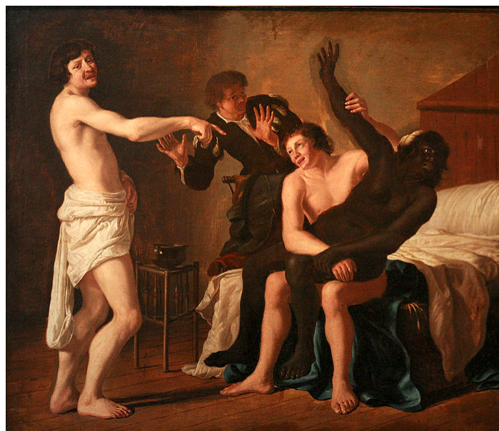
Figure 2. Christiaan van Couwenbergh, Rape of the Negro Girl (1632). Oil on canvas. Musée des Beaux-Arts de Strasbourg.