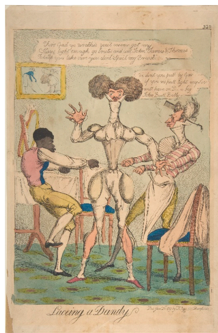
Figure 4. Anonymous, Lacing a Dandy (1819). Hand-colored etching. Satirical print published by Thomas Tegg. The Metropolitan Museum of Art. Source: https://www.metmuseum.org/art/collection/search/384283 .