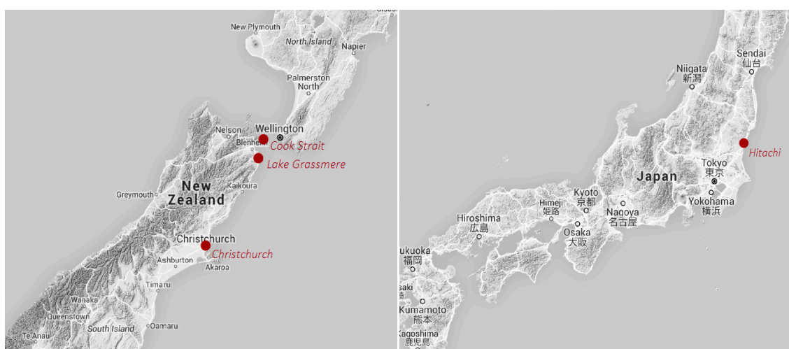
Figure 1. Earthquake survey locations.