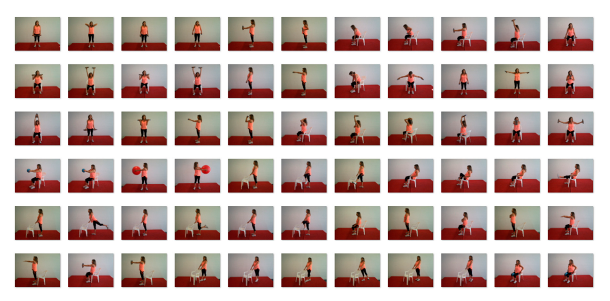
Figure 1. Resistance exercises used in the exercise program.

Five different exercise sessions models were prepared. Each of them had different aerobic, resistance, and agility/balance exercises successively applied over time to induce stimuli variability. Exercise sessions were planned to have moderate-to-vigorous intensity (12–17 points on a rate of perceived exertion scale with 6–20 points). Exercise intensity was systematically controlled using Borg's rate of perceived exertion scale (6–20 points, [23]) and adjusted if necessary during aerobic, resistance, and agility/balance exercise. At the end of each session, all participants were asked to rate the session's overall intensity. The participant's attendance, as well as the occurrence of exercise-related injuries and adverse events, was also recorded.