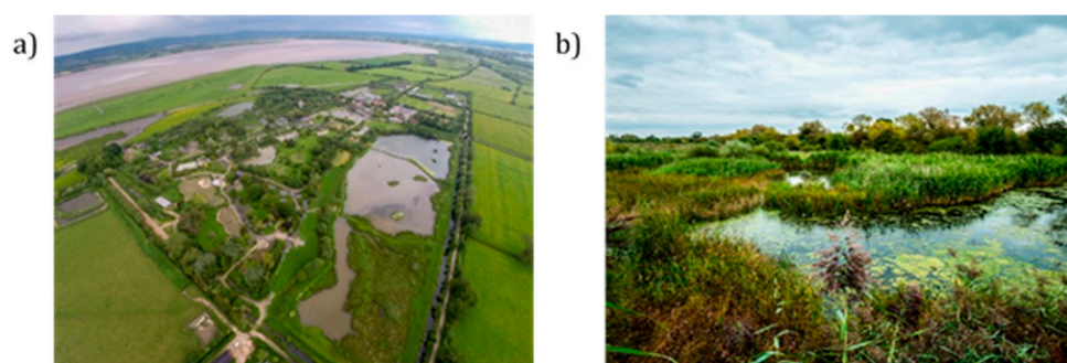
Figure 1. (a) The wetland nature-based health intervention took place within a Wildfowl & Wetlands Trust (WWT) wetland site in Gloucestershire, UK. (b) The site allows visitors to interact with wetland nature in multiple ways, including canoeing through reed beds.

area designations that cover the reserve, including at national level (Site of Special Scientific Interest), European level (a Special Protection Area) and internationally (a Ramsar site).