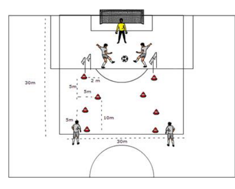
Figure 1. Circuit Training (i.e., 30 \times 30 m<sup>2</sup>, individual occupied area per player = 90 m<sup>2</sup>).

All the SSGs, LSGs and CT repetitions were played and completed by the same 14 players, and the game situations were performed at the club facilities on an outdoor artificial grass pitch with regular goals. Participants wore training clothes and soccer boots. In the SSGs, CT, LSGs and FM there was one goalkeeper per side, but their movements and actions were limited to saving the ball when a shot was aimed at their goal with no other movements allowed. Specific sub-components of each session were categorized according to the focus of training to evaluate the weekly organization of the training sessions and to provide physical demand data on particular aspects of training. This categorization was established following discussions with the team coaches, then the physical requirements and the training of random conditional fields were scheduled as a session devised to enable players to cope with the physical demands of match play [18].