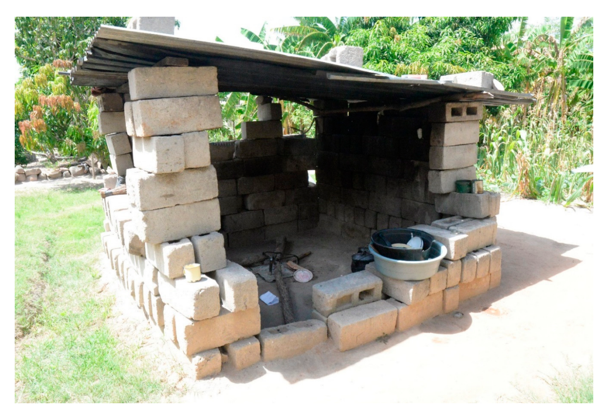
Figure 2. An outdoor kitchen in the Agincourt study site, South Africa: PHIRST <sup>+</sup>, 2016–2018. <sup>+</sup> PHIRST: Prospective Household cohort study of Influenza and Respiratory Syncytial virus community burden and Transmission dynamics in South Africa.