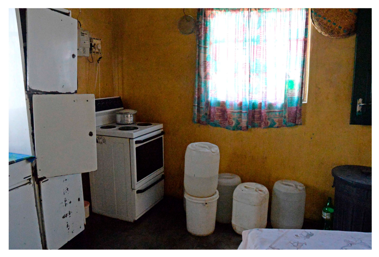
Figure 3. Water storage in an Agincourt kitchen, South Africa: PHIRST<sup>†</sup>, 2016–2018. <sup>†</sup> PHIRST: Prospective Household cohort study of Influenza and Respiratory Syncytial virus community burden and Transmission dynamics in South Africa.