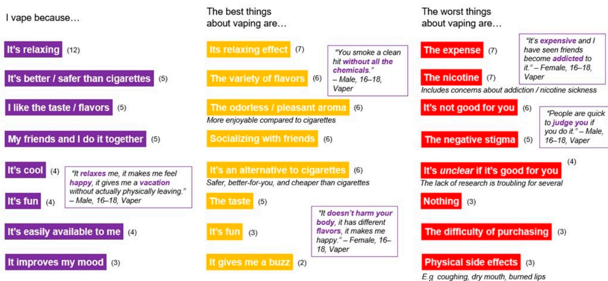
Figure 1. Associations with Vaping. Note: Numbers in parentheses represent the number of participant comments related to the theme.

In the Qualitative Online Community, the theme of socializing was prominent: one of the reasons they vaped the first time was because “my friends and I do it together” and one of the best things about vaping was “socializing with friends.” (Figure 1) Most of the time ENDS users vaped with friends or other people their age. Together they shared flavors and exchanged liquids to experiment. Most vapers indicated they would vape less if their friends didn’t vape. Many participants conveyed the importance of peer influence with quotes such as the following: