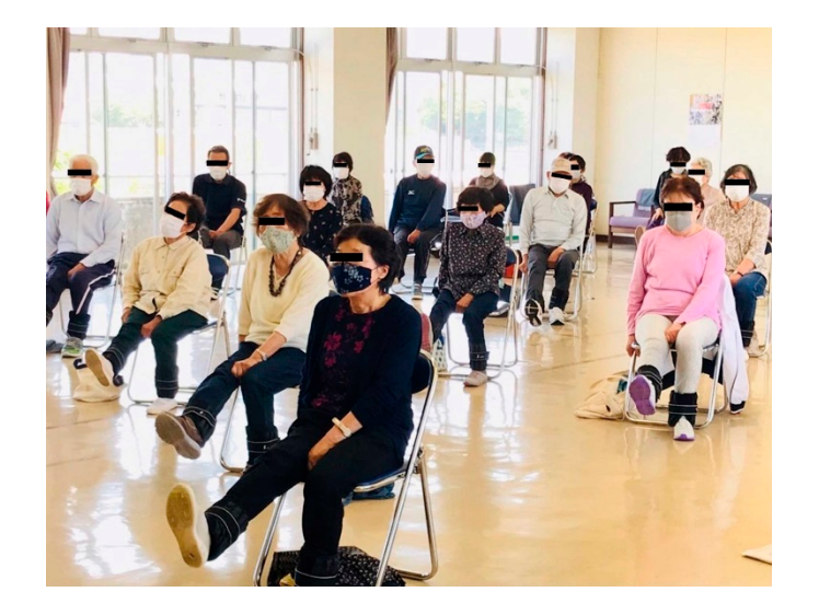
Figure 1. The elderly participate in the "Kayoinoba" in the A City Community Center.

As an early intervention for frailty in Japan, elderly people are encouraged to participate in " Kayoinoba " (Figure 1). " Kayoinoba " is one of the systems established to solve the "2025 issue": An estimated one out of every three people will be over 65 years old, and one out of every five people will be over 75 years old in Japan in 2025. This is a long-term care prevention club that elderly residents can run voluntarily [15].