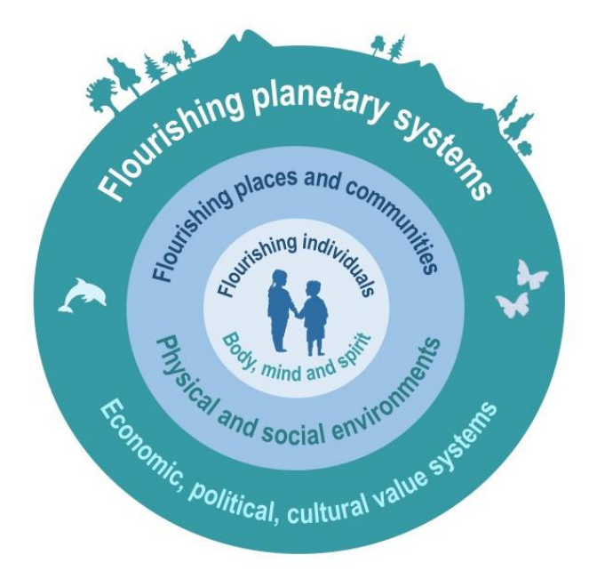
Figure 2. A laudable goal—flourishing as more than the absence of disease: equitable flourishing and fulfillment of individuals requires societies, systems and values that promote mutual flourishing. It also depends on overcoming the systemic factors that undermine this, recognizing the interconnected ways these influence the wellbeing of people, places, and planet.

economic "ecosystems") influence individual biology. Notably, we will explore how advances in "omics" technologies, including microbiome science, have revealed the intricate connections between personal biology and the exposome—as the total lived experience over time. This also serves as a cautionary tale for ARPA-H, one that shows how an exclusive focus on drugs, apps and tests can obscure the interconnections and complexity of NCD prevention and treatment. Finally, we set forth an "upstream" exposome approach that could help ensure ARPA-H fulfills its intended mission. Although ARPA-H is an American agency, if it develops in a similar way to ARPA, it will be of direct and indirect relevance to international research collaborators, scientists and scholars, especially those concerned with environmental and public health. Already, European researchers are underscoring that ARPA-H will cultivate partnerships and cooperation with European and global stakeholders [13].