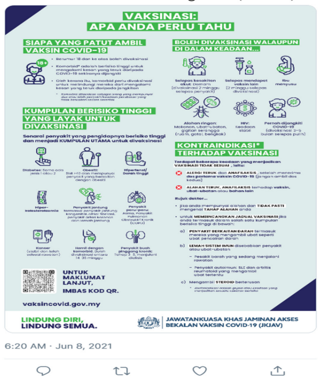
Figure 2. Scenario 1 (high information completeness and high information accuracy).

Vaksin bertindak dengan membina imuniti badan melawan virus SARS-CoV-2 (virus COVID-19) - sumber KKM. Sejarah membuktikan vaksin berkesan mengurangkan penyakit Polio dan Measles dalam masyarakat. Hukum vaksin juga adalah harus menurut Muzakarah Fatwa Kebangsaan (JAKIM).