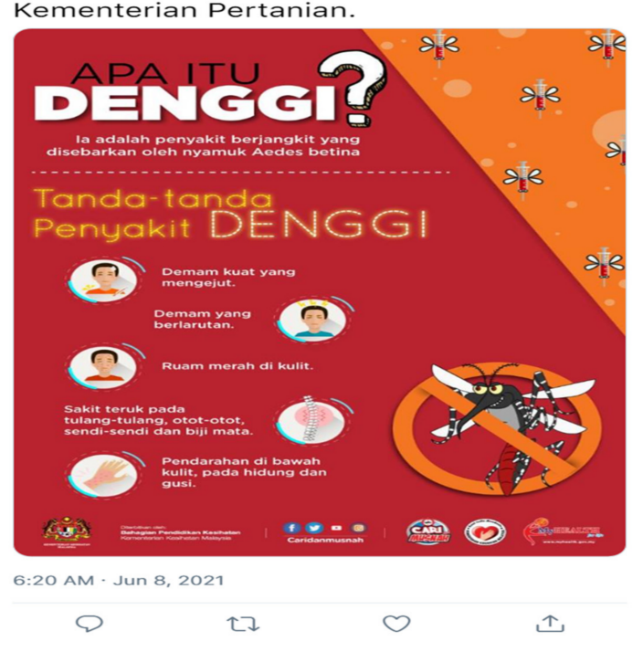
Figure 3. Scenario 2 (high information completeness and low information accuracy).

Vaksin COVID-20 bertindak dengan memakan bakteria e.coli. Sejarah membuktikan vaksin berkesan mengurangkan penyakit obesiti dalam masyarakat. Vaksin juga adalah perlu menurut