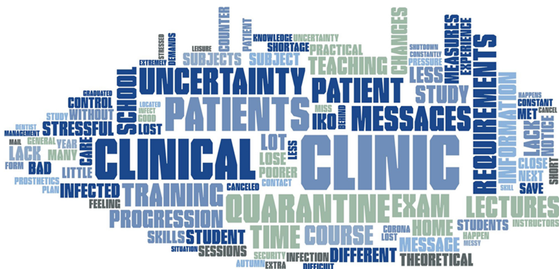
Figure 2. Word cloud as an overview to open question answers.

Figure 2 presents a word cloud for all comments on the open question. The word cloud is an overview of all keywords in the answers. All single words in the students’ answers were summarized, and the most repetitive words are presented with the largest font size. Factors related to the clinical teaching were the most prominent stressors among the students.