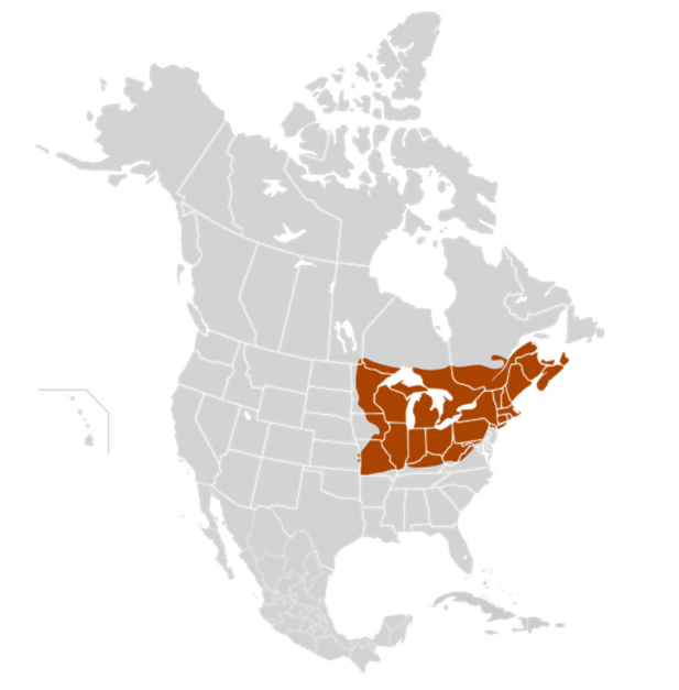
Figure 1. Regions of maple syrup production in Canada and the USA according to the Maple Syrup Producers' Association of Ontario [94].

Several authors, such as Lagacé et al. [49], have studied maple sap during different harvest periods to show variations in its organic composition: sugar (sucrose, fructose, and glucose), organics acid, and phenolic compounds. This means having to change some intrinsic factors, such as maple tree sap flowing in trunks. Moreover, other changes could modify its composition given the microbial maple sap population (fungi and total aerobics), which progressively increase during the season [9,93]. After maple sap is collected, it is contaminated by microorganisms, which are responsible for sucrose hydrolysis and the final presence of fructose and glucose in maple syrup [50].