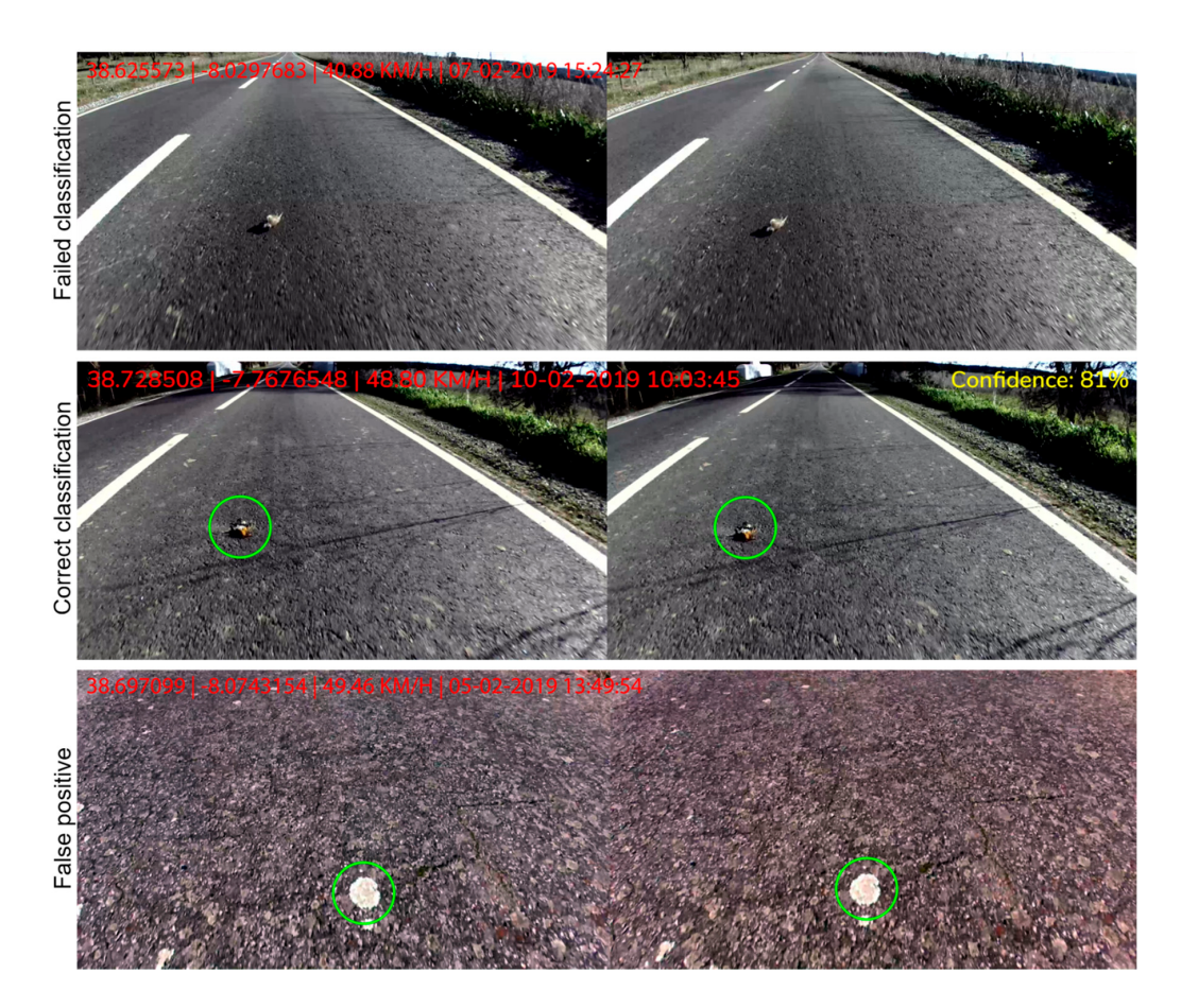
Figure 4. Examples of images captured by the MMS2 during real surveys: in the two upper images, the algorithm failed to detect the WVC (failed classification); in the middle images, the algorithm correctly detected the WVC (correct classification); and in the lower ones, the algorithm detected an animal incorrectly (false positive). The ZED camera is a dual-camera, always providing two images with slightly different angles.

The real surveys resulted in a rate of correct classification of 78%, overlooking therefore 22% of the animals on surveyed roads (Figure 4). Approximately 17% of the images classified with WVCs were false positives. The algorithm classified 37.1% of the detected animals to the species level (the remainder was classified as "others"). Together, the controlled surveys and real surveys resulted in more than a million road images. We compiled the main differences between the MMS1 and the MMS2 in Table 2.