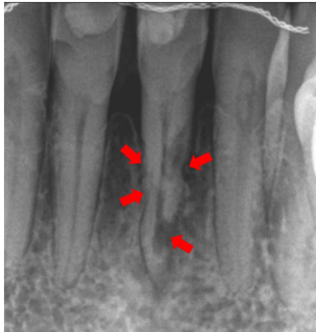
Figure 2. Periapical radiograph of tooth #24. Extensive resorptive defect observed on multiple areas of the dental root. The prognosis for this tooth was deemed guarded due to advanced ERR.

root canal system. Had the patient been screened for ERR biomarkers during her routine dental exams, ERR could have been detected earlier with a much better prognosis.