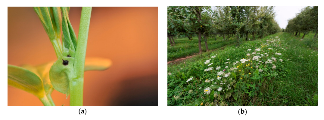
Figure 2. Floral resources to promote natural enemies in apple orchards. ( a ) Faba bean with extrafloral glands situated in the black spot on the Stipulae. Faba bean was experimented as cover crop. ( b ) Flower strip composed of perennial plant species between tree rows.