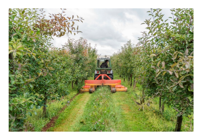
Figure 3. Management of inter-row perennial flower strips in an apple orchard by using a specific mulching device. The flower strip is about 0.5 m wide, whereas the adjacent vegetation is cut down frequently to reduce establishment of voles and competition for water and nutrients.

biopesticide [124] are expected to further promote natural pest control, because of the lower disturbance due to a reduced use of nonspecific insecticides. An increased uptake of such solutions by conventional farmers also is highly desired.