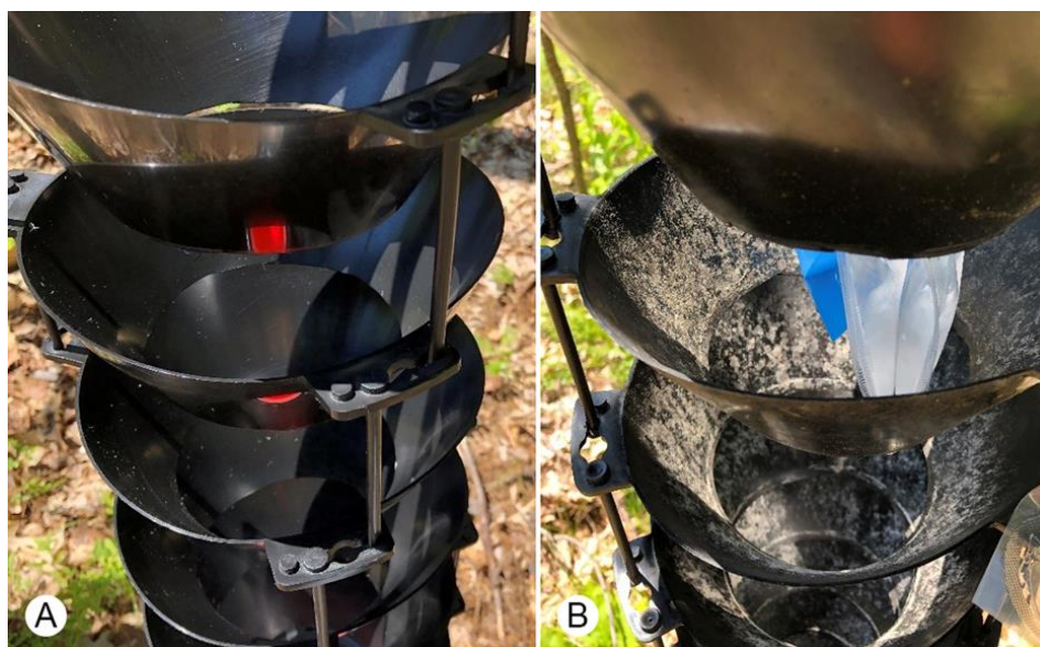
Figure 2. Example of modified multiple-funnel trap treatments from Experiment 2 after six weeks in a mixed hardwood-pine stand in southern Maine. (A) Trap cleaned with baby wipes during biweekly collections. (B) Control trap that was clean at the beginning of the season and then never maintained.