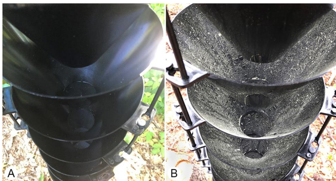
Figure 1. Example of multiple-funnel trap treatments from Experiment 1 in a mixed conifer stand in southeastern New Hampshire. (A) Clean trap without surfactant switched out biweekly with a clean trap; (B) Control trap without surfactant after six weeks in the field (not shown: two additional treatments of surfactant-treated clean trap and surfactant-treated control trap).