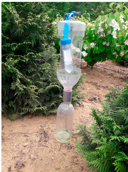
Figure 1. Bottle trap design used in this study placed within an ornamental tree nursery.

On 7 May 2018, we deployed a total of 36 bottle traps baited with either pure 70% ethanol or 70% denatured ethanol at nine sites representing managed habitats in north-eastern Ohio, USA. Three of the sites were ornamental tree nurseries, three were fruit tree orchards, and three were lumber yards. Traps were suspended vertically 0.6 m above ground level by attaching the inverted end of the 1 L bottle to a metal rod with a wire. Four traps were deployed at each site consisting of two traps baited with 70% absolute ethanol and two baited with 70% denatured ethanol. Two of the four traps were deployed within the interior of the site 25 m from the forest edge and two traps were positioned at the forest edge neighboring the site (Figure 1).