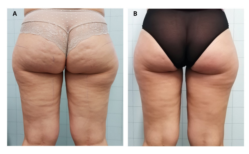
Figure 4. Improvement of the cellulite of a female patient before ( A ) and 3 months after the last treatment with ONDA ( B ).