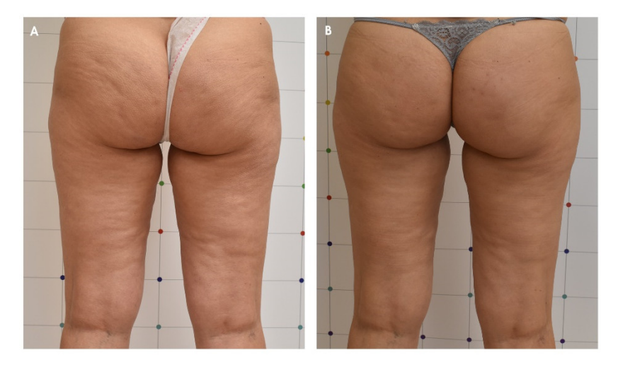
Figure 3. Improvement of the cellulite of a female patient before ( A ) and 3 months after the last treatment with ONDA ( B ).

None of the patients experienced pain (at most, the patient reported a slight tingling/sensation of contraction) or other side effects during the treatment or the follow-up period. However, it was possible to observe a temporary mild redness on the skin due to the passage of microwaves that cause subcutaneous heating, which resolved within a few days.